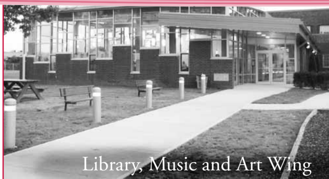
Library, Music and Art Wing