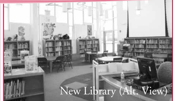
New Library (Alt. View)