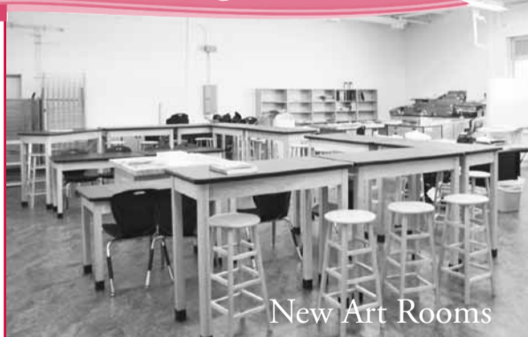
New Art Rooms