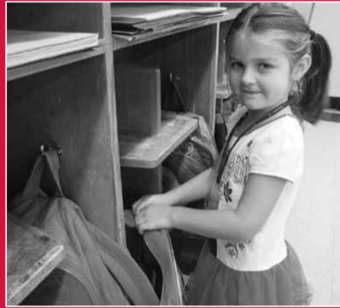
This is the first year the district launched a pre-K program with full-day and half-day options.