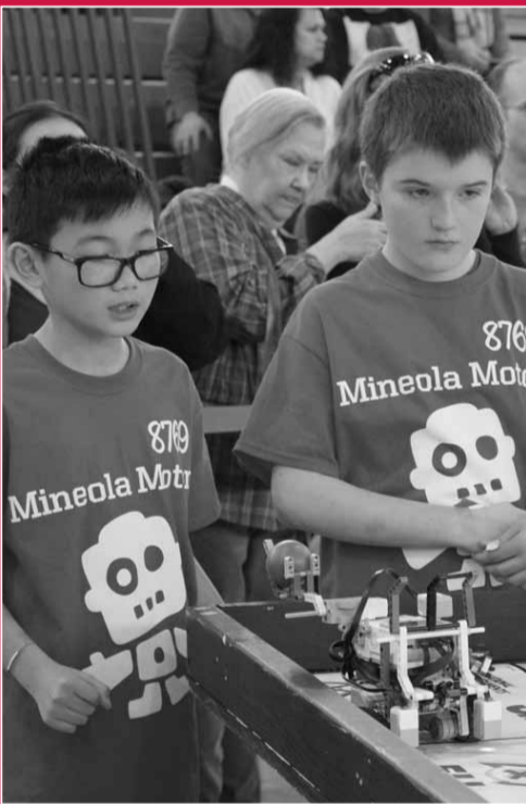
MHS hosted the FIRST Lego League competition on Jan. 31. Mineola's team won an award for the Alliance Round, where they teamed up with another group at random and scored the highest point value.