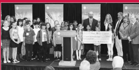
The Be the Change for Kids Award for Innovation came with grant monies from the New York State School Boards Association that the district will use to enhance its already extensive program.