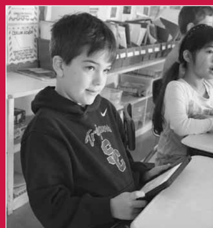
The districtwide iPad initiative includes classroom carts at each of the primary schools and a 1:1 take-home program for grades K-12.