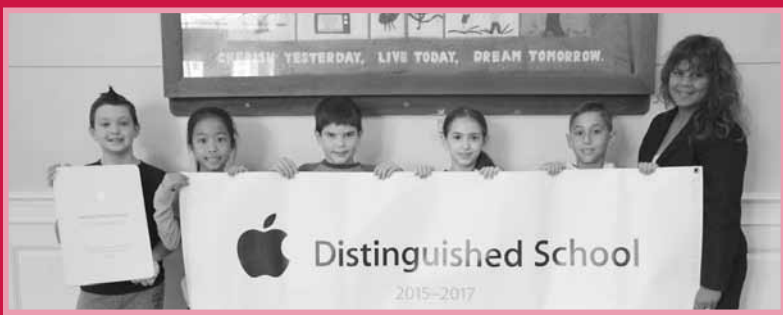
This year, Jackson Avenue School joined Mineola Middle School as being named an Apple Distinguished School.