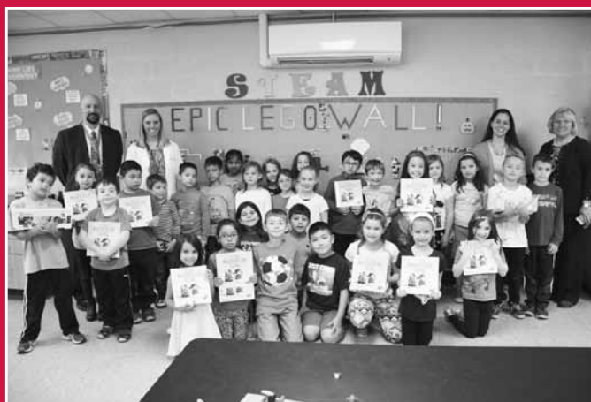
Meadow Drive School unveiled an Epic Lego Wall in its STEAM room for kindergartners through second-graders.