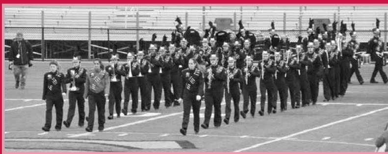
For the eighth consecutive year, Mineola School District has been named one of the Best Communities for Music Education in America by the NAMM Foundation.