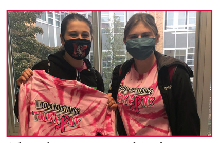
The girls soccer team and Student Organization sold Think Pink shirts, with all proceeds going toward breast cancer research and awareness. Students and staff came together in late October, showing off their shirts on the same day.

As we moved into the holiday season, we celebrated with a holiday pajama day as well as a Mineola spirit day for students and staff to show off our colors. We look forward to keeping our traditions and continuing to shine a positive light on our students as we enter the new year.