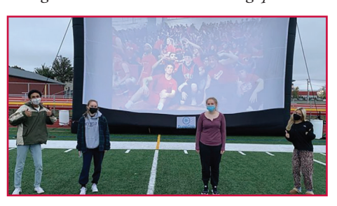
The senior class bundled up on the high school football field for a socially distanced Halloween movie night in October. Not only did students get to watch the big screen, some also participated in a costume contest.