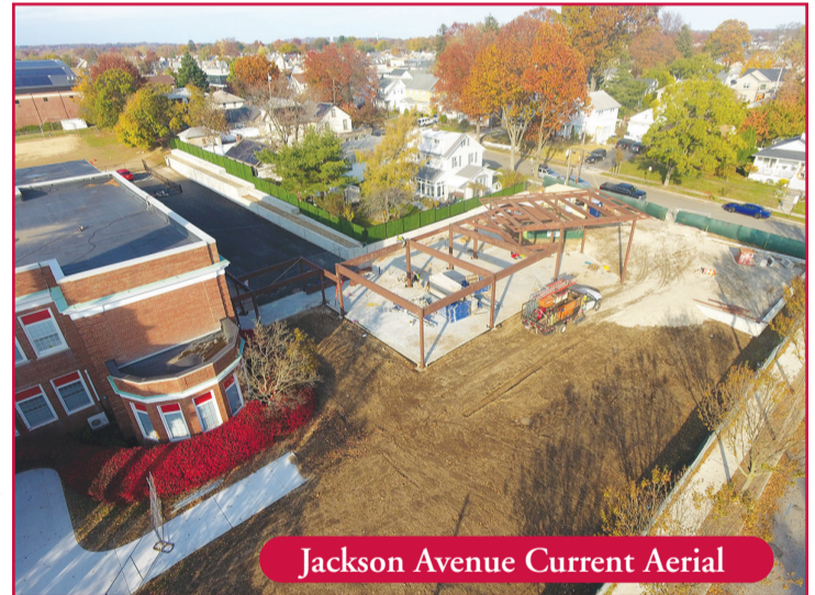
Jackson Avenue Current Aerial