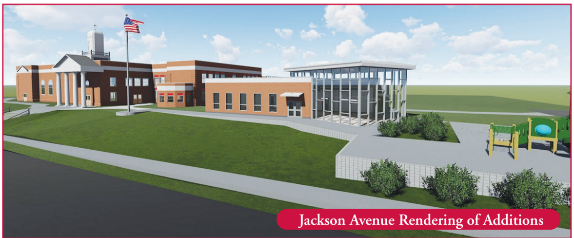
Jackson Avenue Rendering of Additions