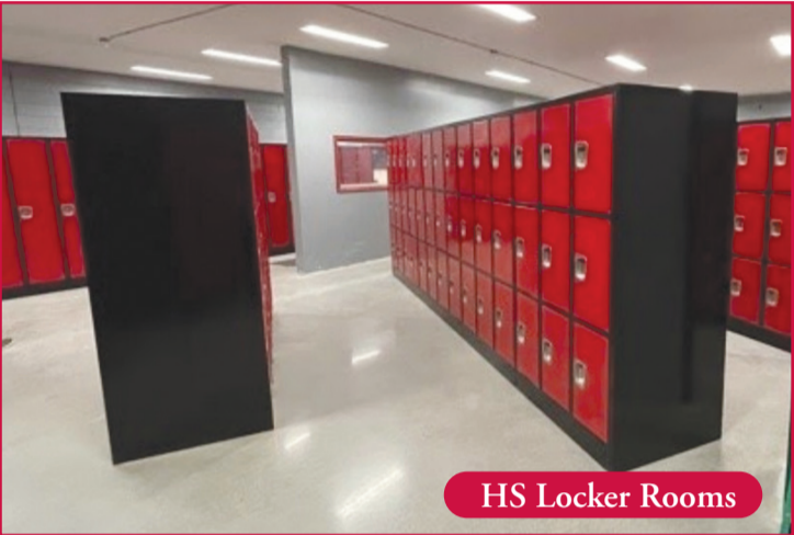
HS Locker Rooms