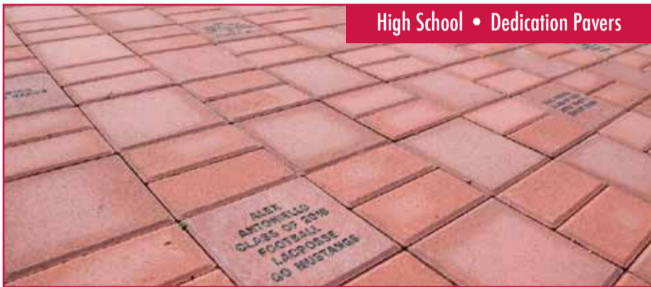
High School • Dedication Pavers