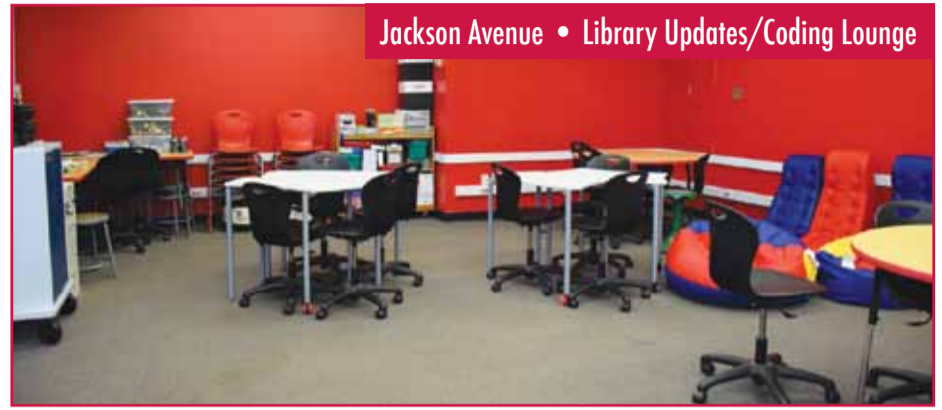
Jackson Avenue • Library Updates/Coding Lounge