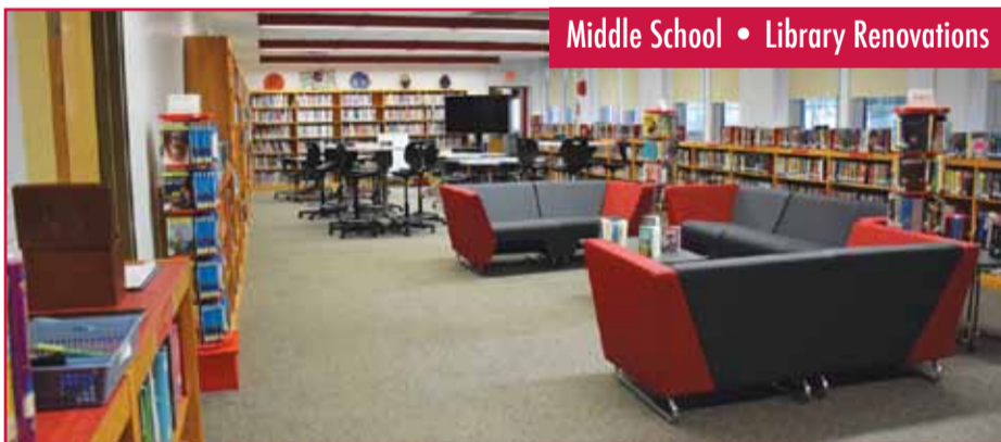
Middle School • Library Renovations