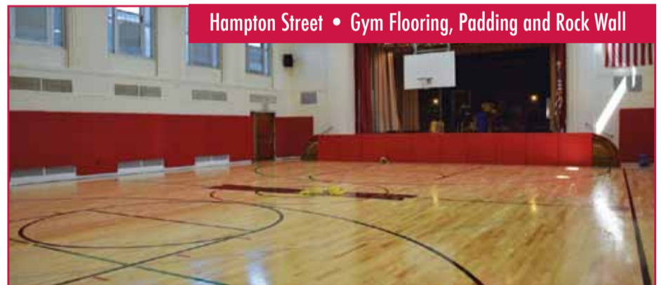
Hampton Street • Gym Flooring, Padding and Rock Wall