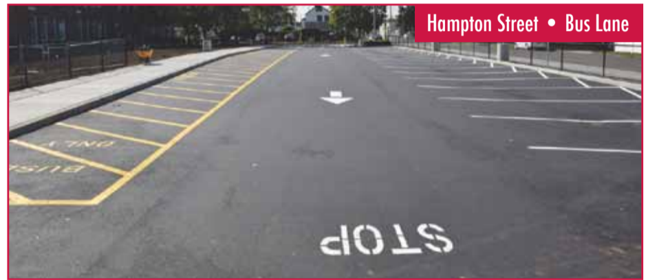
Hampton Street • Bus Lane