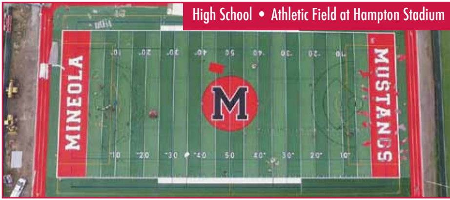
High School • Athletic Field at Hampton Stadium

Along with contractors, the district's maintenance and custodial staff have been hard at work the last few months renovating and upgrading facilities, districtwide. The Board of Education is proud to be able to complete these renovations for the benefit of our students, staff and community, all without the need to bond any money.