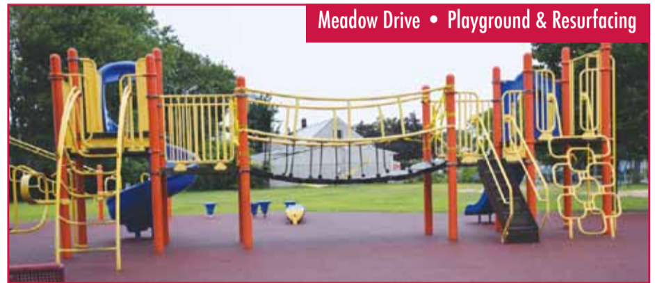
Meadow Drive • Playground & Resurfacing