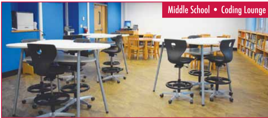
Middle School • Coding Lounge