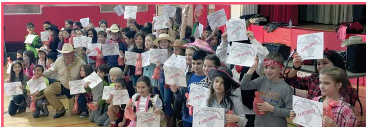
To garner excitement about reading, each of the elementary buildings host PARP events every year. At left, Jackson Avenue's was set to the theme of the Wild West and Meadow Drive's (at right) to the theme of Emojis in the Possibilities.