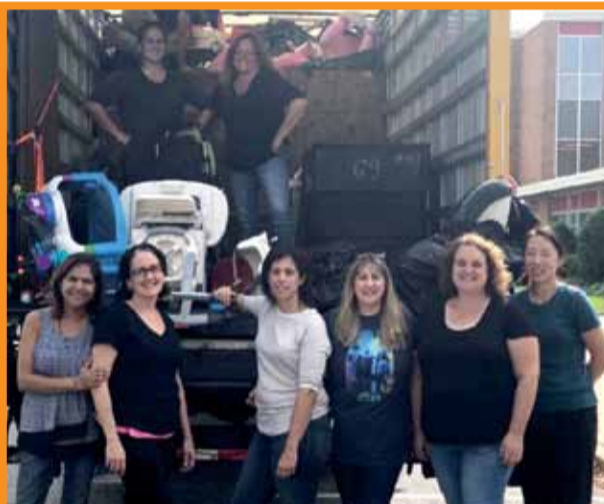
Each year, the High School PTSA hosts a Fall Clean-Out, which asks community members to donate clothing and household items they are no longer using.