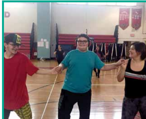
SEPTA hosts a variety of events throughout the year that every student K-12 looks forward to.