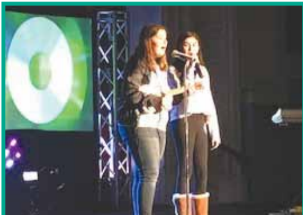
The MMS Idol, hosted by the PTA, is an event that allows our students' talents to shine.