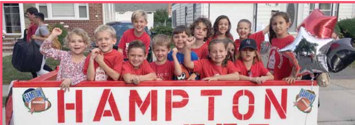
The PTAs each play a crucial role in helping coordinate activities and participation in many districtwide events, including Homecoming.