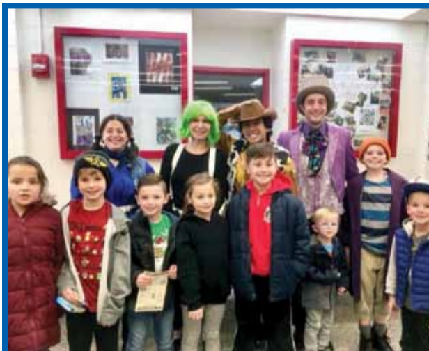
District Council PTA hosts a Cultural Arts Series each year. This is from a show called "Willy Wonka."