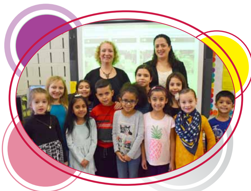
Hampton Street School was named one of six winners in the national Paper Tower Challenge. They also received several honorable mentions.