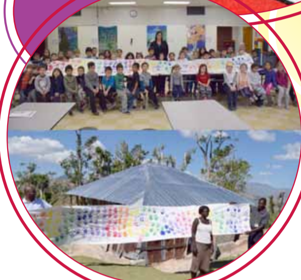
Meadow students donated money to put their handprints on a banner that was taken to Haiti. The money was used to assist in restoration efforts after the hurricane.