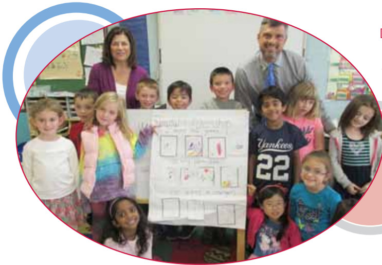
Meadow Drive School has been recognized as a Certified School for Digital Citizenship by Common Sense Education. Jackson Avenue received this distinction last year.