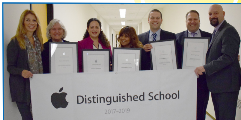
All five schools in the district earned designation as an Apple Distinguished School for 2017-19.