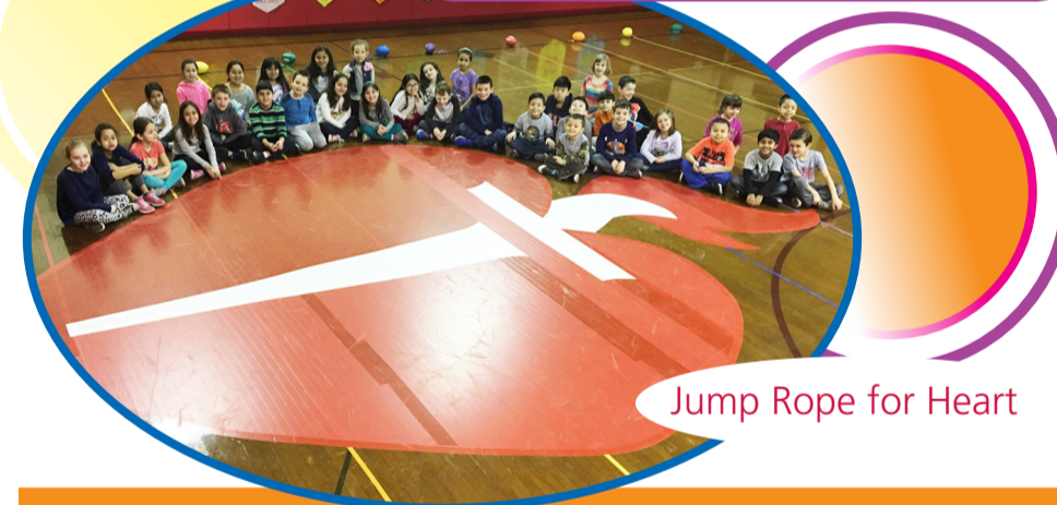
Jump Rope for Heart