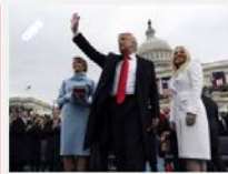
America First: The Inaug...