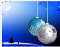
Holiday Clothing Drive