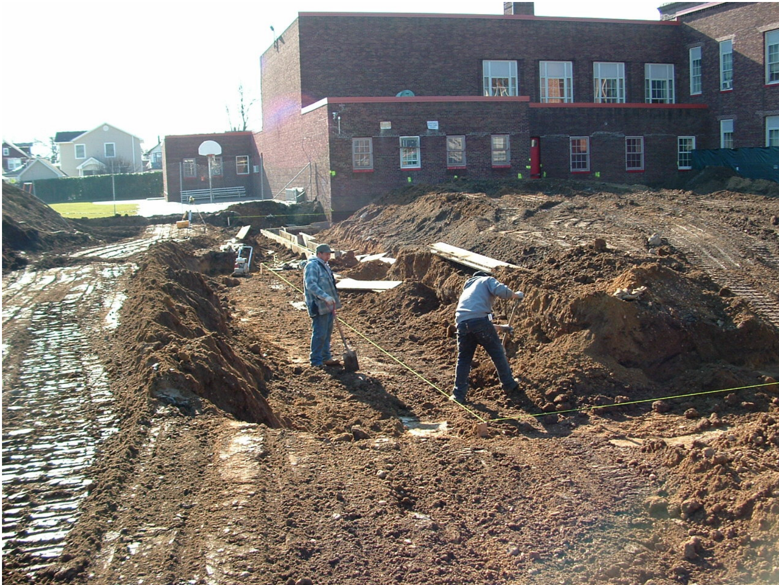
Forming for concrete footings (January 11, 2012)