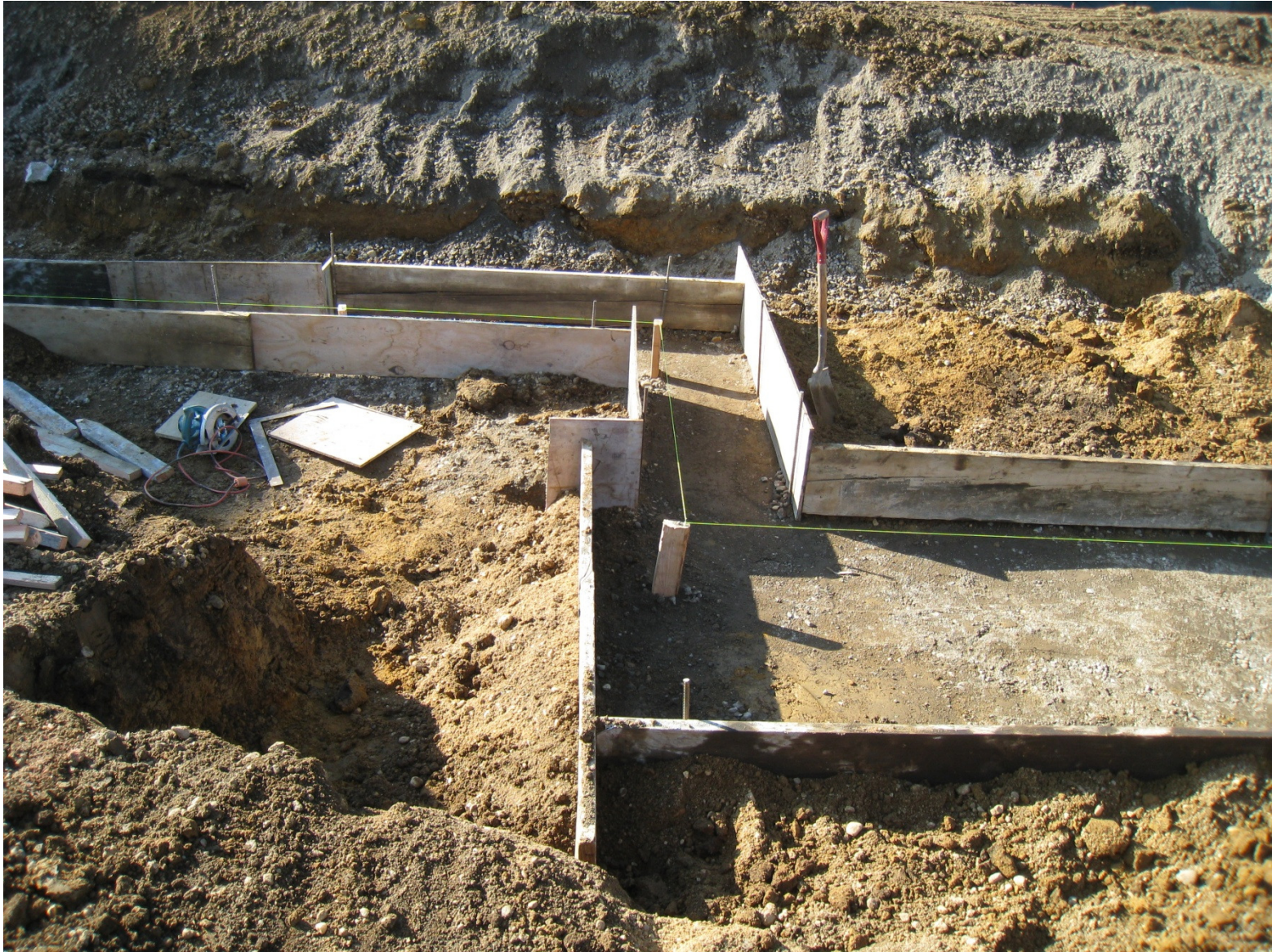
Formwork for concrete footings (January 11, 2012)