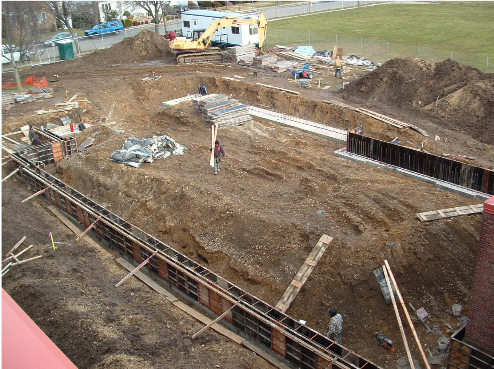
Progress with footings and foundation walls (January 18, 2012)