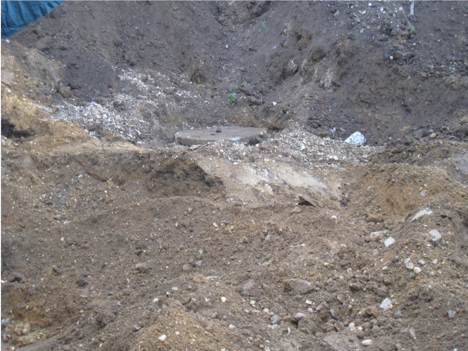
3 drywells found approximately 8' below grade (January 10, 2012)