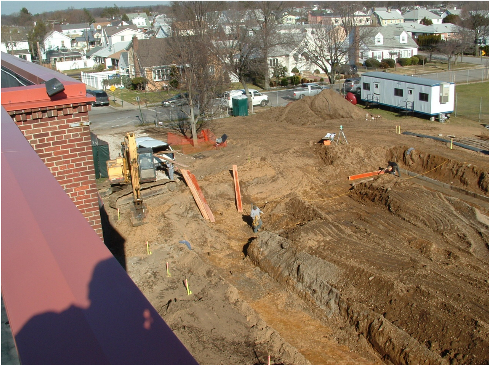
Overview of excavation for concrete footings (January 11, 2012)