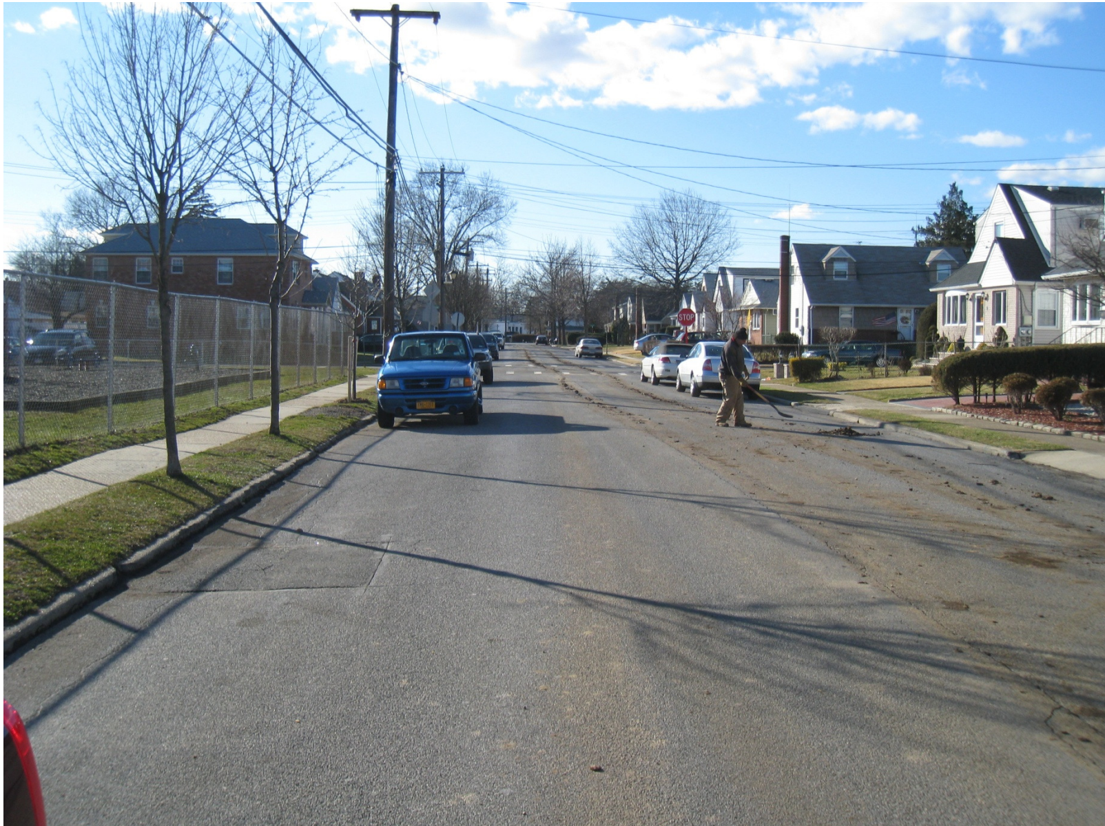
The contractors are conscientious about keeping the area clean. (January 18, 2012)