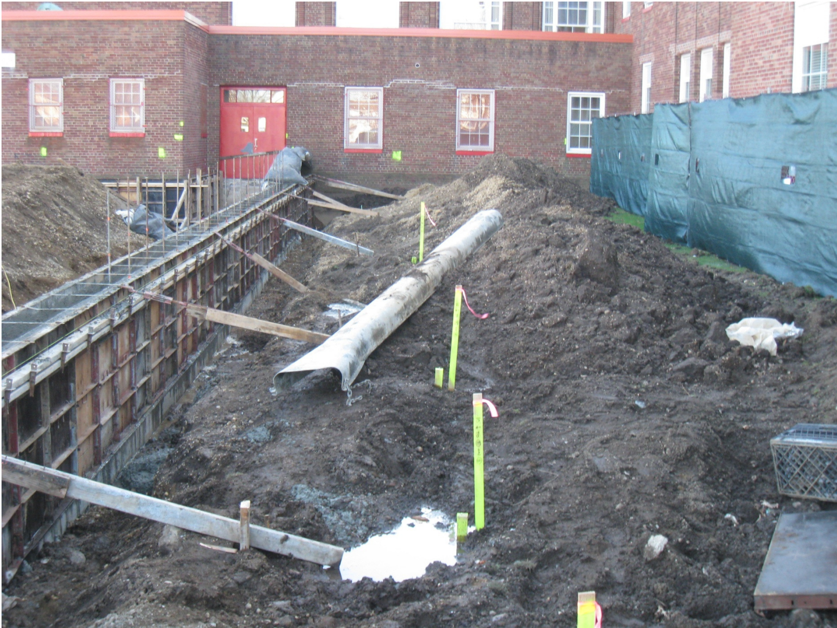
Progress with footings and foundation walls (January 18, 2012)