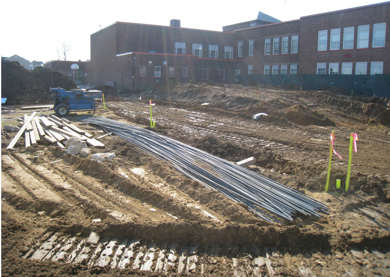
Reinforcement for concrete footings (January 11, 2012)