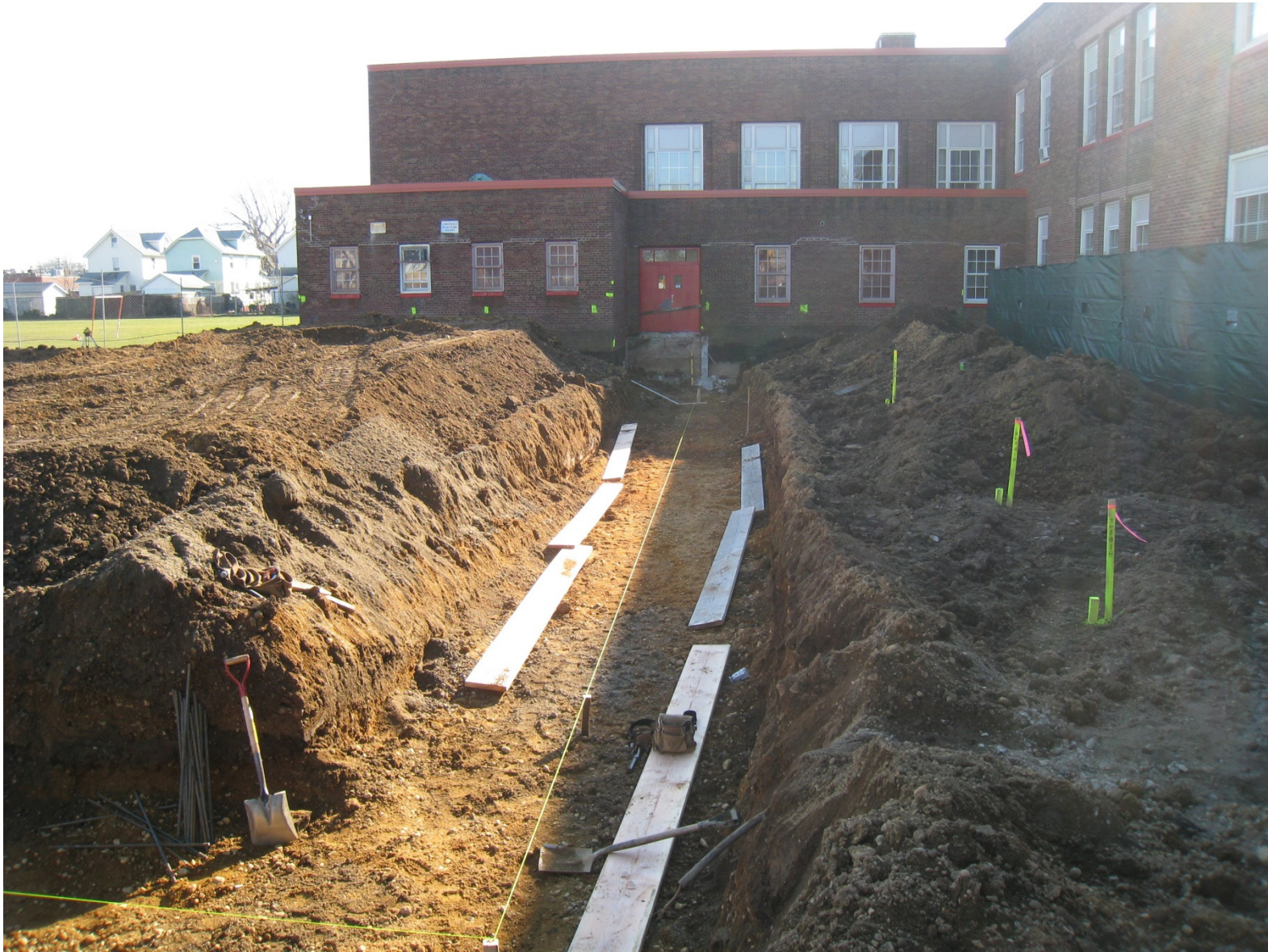
Excavation for concrete footings (January 11, 2012)