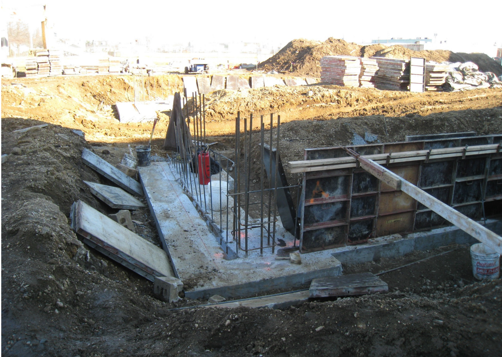
Progress with footings and foundation walls (January 18, 2012)