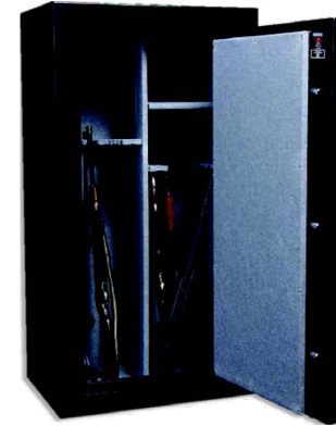
GUN SAFE / VAULT

The Texas Department of Public Safety does not endorse any type or manufacturer of gun safes or locks.