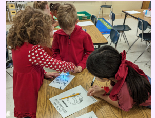
STEM students work collaboratively to code ozobots

Creating a Spark for STEM Career Pathways