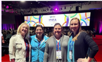
Our Fabulous Madison City Health Science Teachers

Developing the Future Health Science/Biomedical Workforce