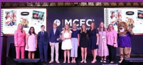
Liberty Middle School's S2S Team won the Pete Taylor Award and Middle School Team of the Year at the MCEC Conference

THE 2024 MCEC GLOBAL SUMMIT TOOK PLACE IN WASHINGTON, DC JULY 29 - AUGUST 1. A WEEK AT THE MCEC GLOBAL SUMMIT ENHANCES SKILLS THROUGH PERSONAL AND SMALL GROUP SESSIONS. ADVISORS, STUDENTS, AND ADULTS GAIN CONFIDENCE AND COMPETENCE IN THEIR LEADERSHIP ABILITIES AND COMMIT TO STRENGTHENING THEIR LOCAL S2S PROGRAMS.