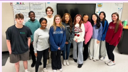
Congratulations to our newest group of Certified Patient Care Technicians! We are so proud of you & can't wait to see all your future holds!

Developing the Future Health Science/Biomedical Workforce