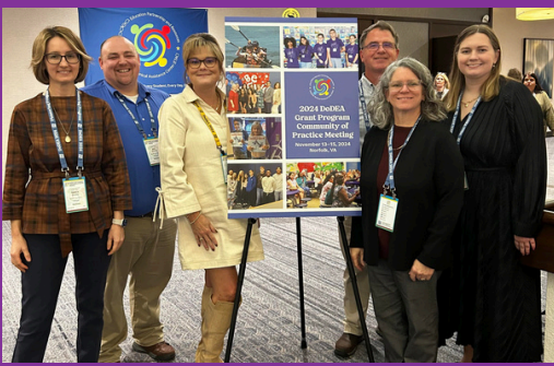
The DoDEA Grants Team at the DoDEA CoP Meeting in Norfolk, VA.

The 2024 DoDEA Annual Conference took place in Norfolk, VA on November 13-15. This year's CoP, themed "Pioneering Progress," provided grantees with valuable resources, showcased successful practices, and inspired forward-thinking strategies to enhance student learning and achievement. Attendees were placed in groups that visited local schools, a museum, or a childhood center that offered grantees practical insight and guidance for promising practices.