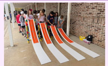
STEM students participate in STEM Day activities.

Creating a Spark for STEM Career Pathways