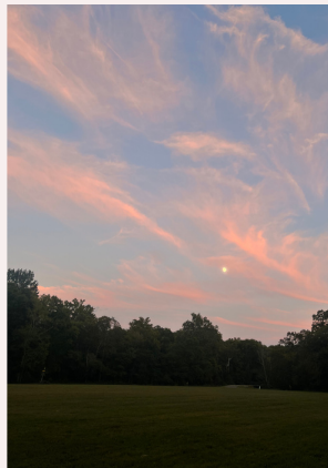
REFERENCE PHOTO: INDIAN CREEK GREENWAY