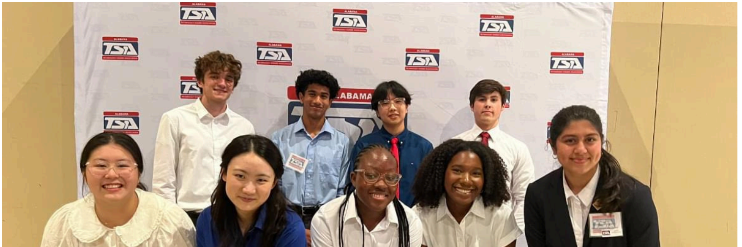
Students from James Clemens High School attending the Technology Student Association (TSA) Conference