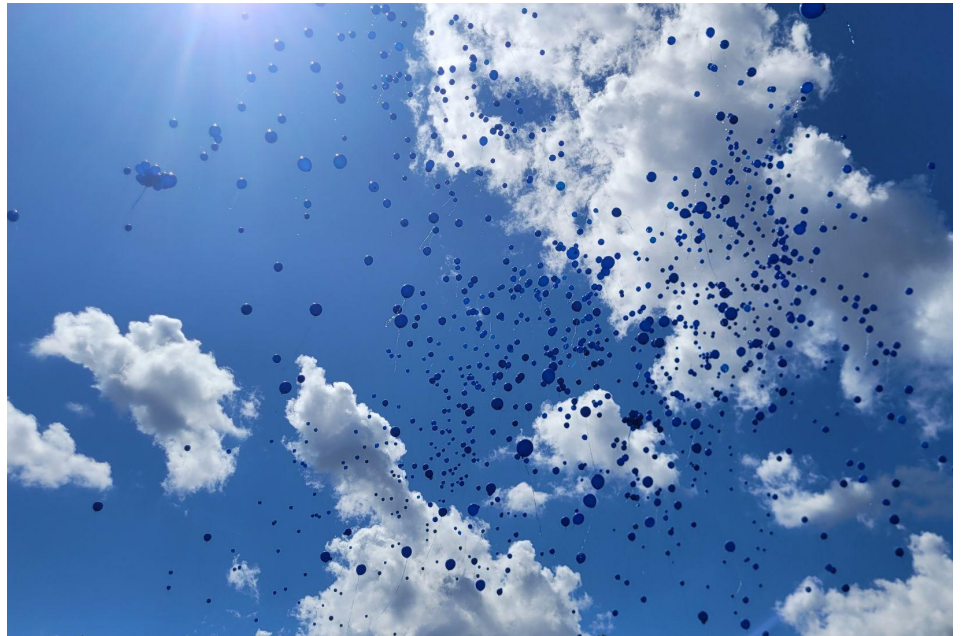
Balloons released during the memorial service held at Liberty Middle School.