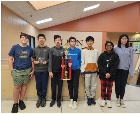
LMS Geometry Team