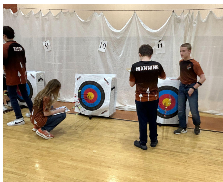
LMS Archery Team at the Madison City Tri-City Shootout.