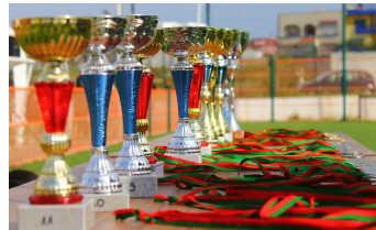
A year of wins