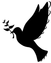
Williams' impact on LMS