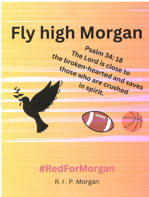
Flyer found around LMS. Created by Annelise Voltz.