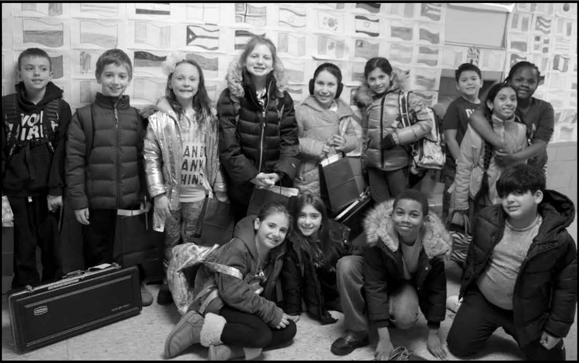
Members of Waverly Park Elementary School's Foreign Language Club.

Closer to the real world than ever before, Lynbrook High School students can participate in multiple clubs and organizations throughout the school year to prepare them for the next chapter of their lives. This involvement is not just beneficial for their résumés as they prepare to graduate, but also gives them the skills to grow as a team player and leader in the school and throughout the community. The high school provides an extracurricular program for every interest. Students are involved in Chess Club, the fall musical/spring drama, Film Club, the school's newspaper club Horizon, Key Club, Mathletes, Robotics, SADD, Science Olympiad, and Speech and Debate Club, among others.