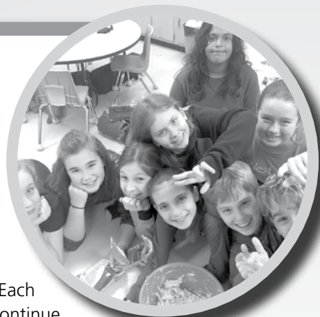
Lynbrook South Middle School students in Cooking/Culture Club baked together.

The exploration of foreign cultures does not end once students reach middle school. Lynbrook South Middle School offers a Cooking/Culture Club for all sixth-through eighth-graders. The club has approximately 30 members and meets for about eight sessions during the school year. The students have done everything from cutting vegetables to baking gluten-free cookies, cupcakes and pizza bagels. Throughout the process, the students learn about the ingredients and history of the items they are making.