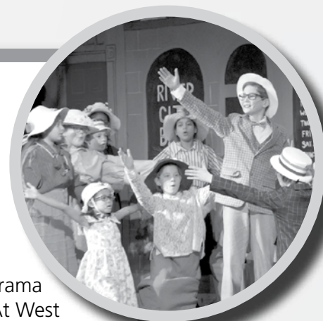
West End Elementary School Drama Club students performed "The Music Man Kids" for their peers.