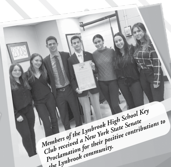
Members of the Lynbrook High School Key Club received a New York State Senate Proclamation for their positive contributions to the Lynbrook community.