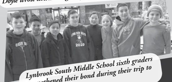
Lynbrook South Middle School sixth graders strengthened their bond during their trip to Frost Valley.