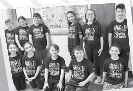
Marion Street Elementary School students showed their support for Autism Speaks by wearing T-shirts with the statement, "In a world where you can be anything, be kind."