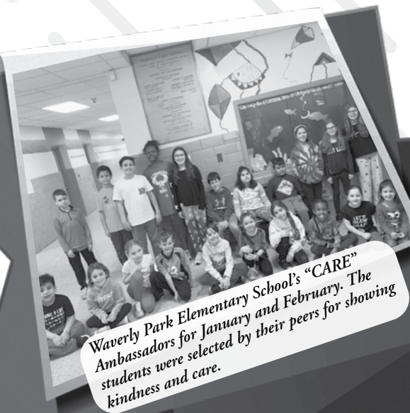
Waverly Park Elementary School's "CARE" Ambassadors for January and February. The students were selected by their peers for showing kindness and care.

Fostering a community of caring starts at the building level. Many lessons, programs, service projects and initiatives that promote kindness have been a significant part of the middle school learning environment. Students have participated in programs such as Start With Hello Week and No Name-Calling Week. Both are celebrated nationally to put an end to bullying and to promote inclusivity and acceptance. Middle school students have also taken trips to enhance student bonding. This includes the sixth grade Frost Valley trip. Students from both middle schools enjoyed the Frost Valley experience this year as it allowed them to learn more about their peers, practice teamwork and develop an appreciation for one another. The positive skills that culminated from these trips translated well as students returned to school with new friends and long-lasting memories.