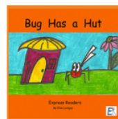
Step 1 (CVC Words)