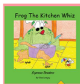
Step 6 (silent letters)