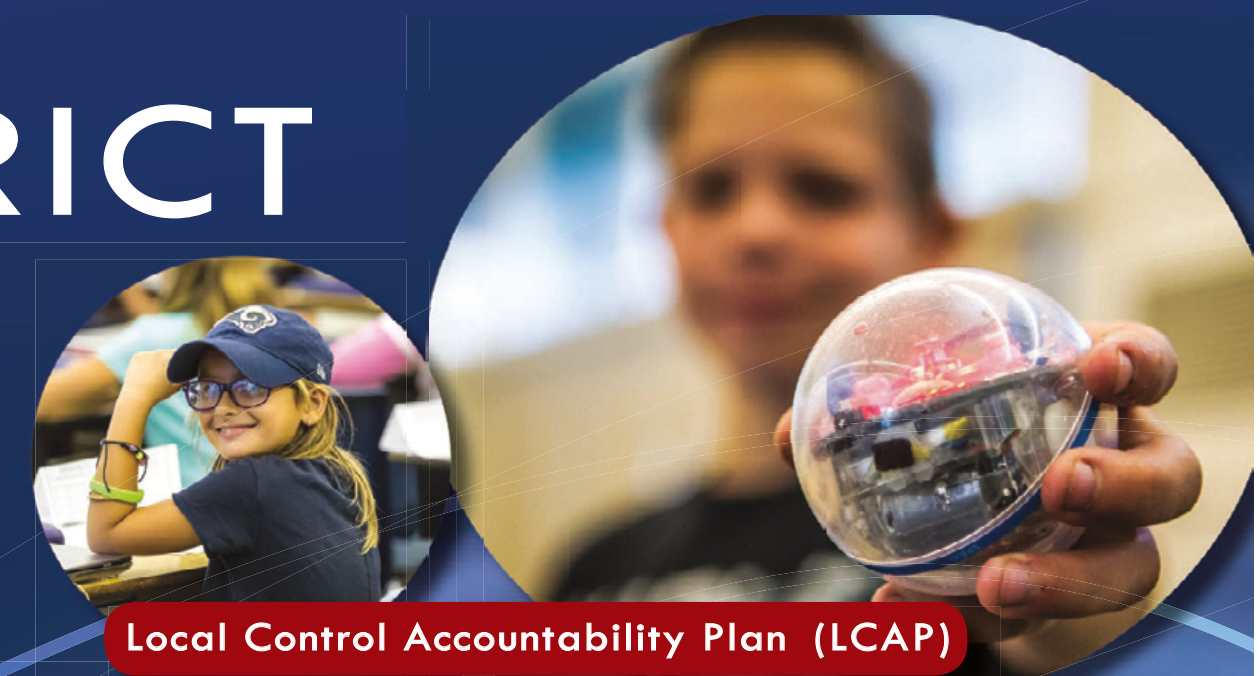
Local Control Accountability Plan (LCAP)