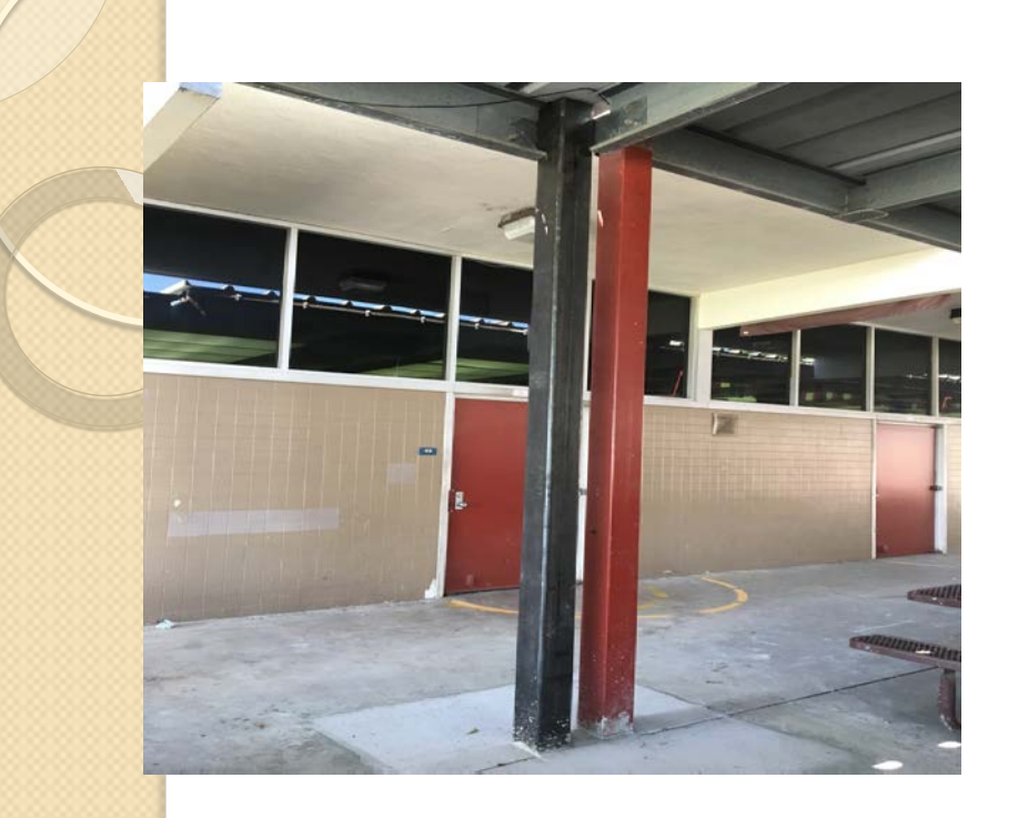
New Column Completed