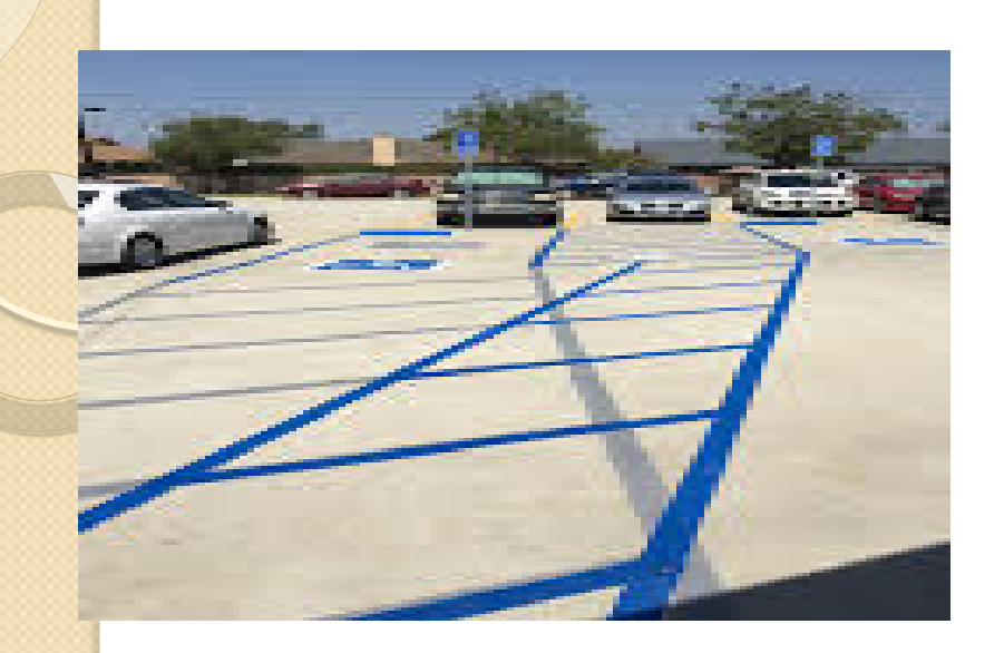
Revised Parking layout