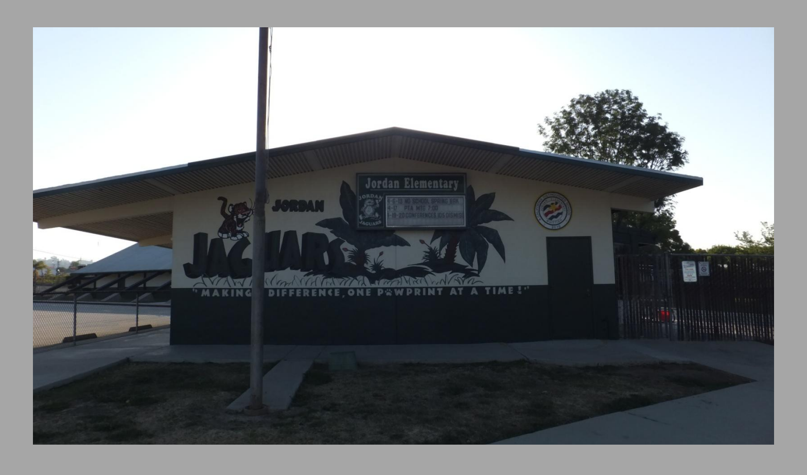
D-18: PARENT GROUPS HAVE EXPRESSED THE NEED FOR AN ELECTRONIC MARQUEE AT EACH SITE TO HELP KEEP THE COMMUNITY INFORMED ABOUT SCHOOL EVENTS.