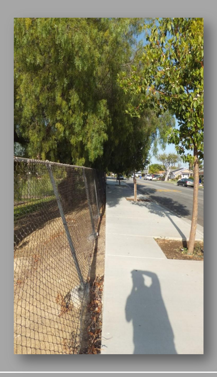
M-4: REPAIR SITE DRAINAGE AND REPLACE FENCE ALONG SILVER GROVE.