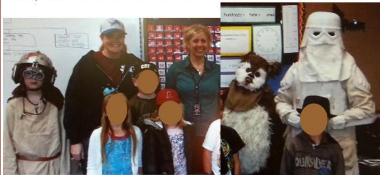
For safety reasons, we are not allowed to show any of the children's faces online, so they have been blurred.