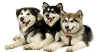
Alden L. Jack, Principal

Parents, please remember that the school parking lots are reserved for parents who need to park their vehicle and can escort their children safely across the parking lot and crosswalks to the school building. If you are not exiting the car with your children, you are required to use the circle drive for curb-side drop-off and pick-up. The school parking lots should NOT serve the same drop-off and pick-up function as the circle drive. It is unsafe for vehicles to pull in to the parking lot and have students exit from vehicles that are not parked.