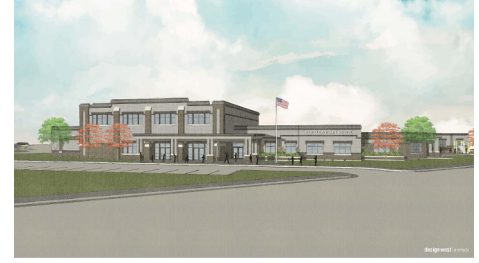
NORTH END ELEMENTARY SCHOOL Hyde Park or Smithfield, UT