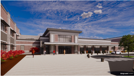
NEW HYDE PARK MIDDLE SCHOOL 250 S 200 W, Hyde Park, UT