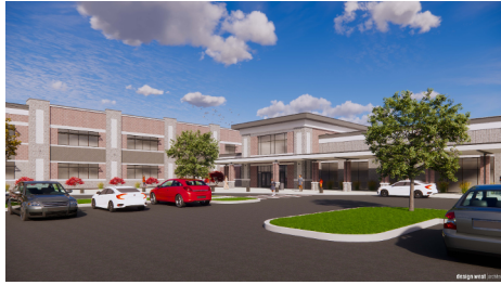
NEW NIBLEY MIDDLE SCHOOL 915 W 3200 S, Nibley, UT