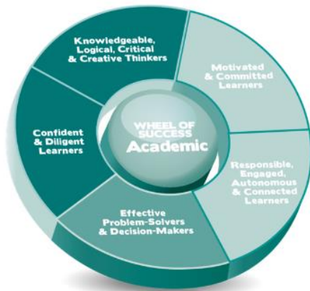
WHEEL ONE: ACADEMIC DOMAIN