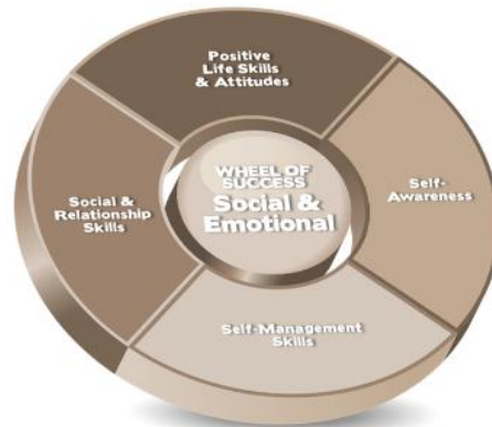
WHEEL TWO: SOCIAL & EMOTIONAL