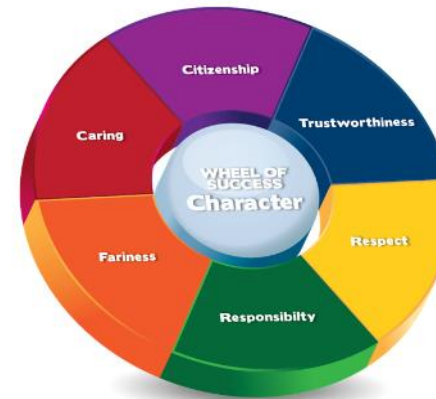
WHEEL THREE: CHARACTER