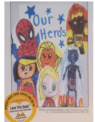
Students illustrated the cover of their Superheroes book.