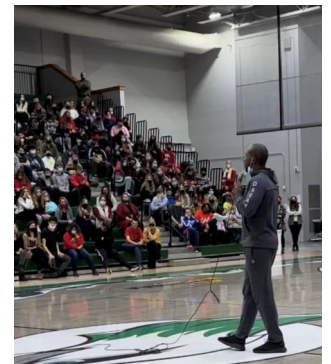
Presentations from NFL retirees promote mental health.