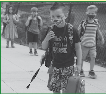
Students at Washington Drive Primary School on their first day.