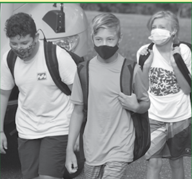
Oldfield Middle School students were welcomed back to school on opening day.