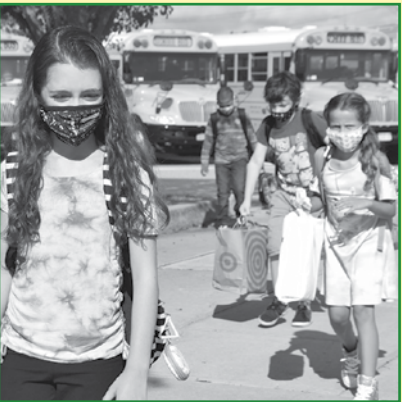
Thomas J. Lahey Elementary School welcomed students back to school.