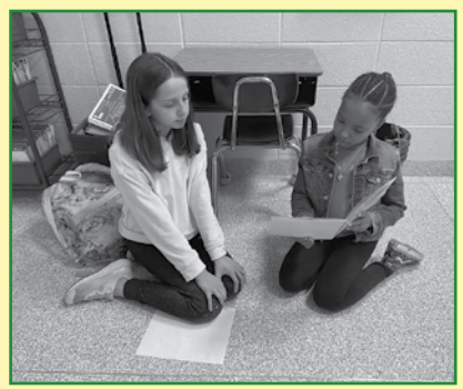
TJL third and fifth graders partnered to socialize and share their information writing books and Women in History posters.