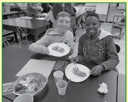
Oldfield science classes concluded their introduction to the study of cell biology by building and eating candy plant "cells."