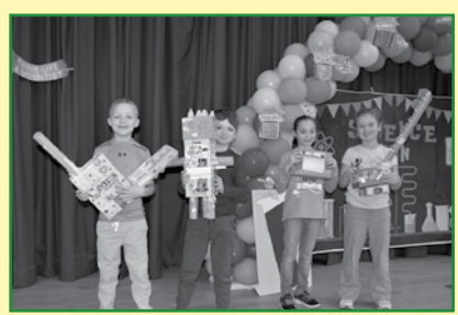
Washington Drive students designed and created models of their very own "Most Magnificent Thing."