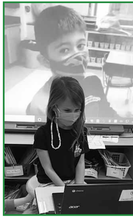
Students at Washington Drive Primary School connected with their classmates during the school's first "Chew and Chat" session on Oct. 20.