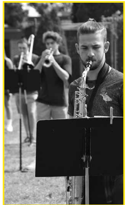
Harborfields High School band students safely practice together with their classmates during lessons and rehearsals.