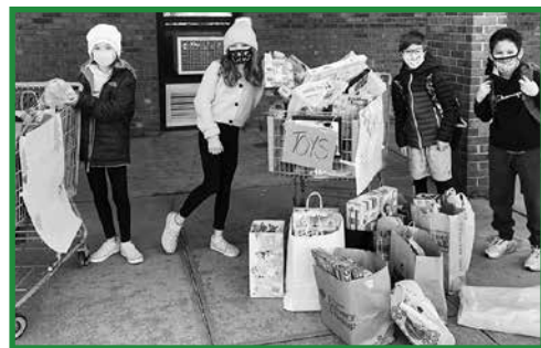
Thomas J. Lahey Elementary School students donated toys and pajamas to benefit families in need for the holidays.