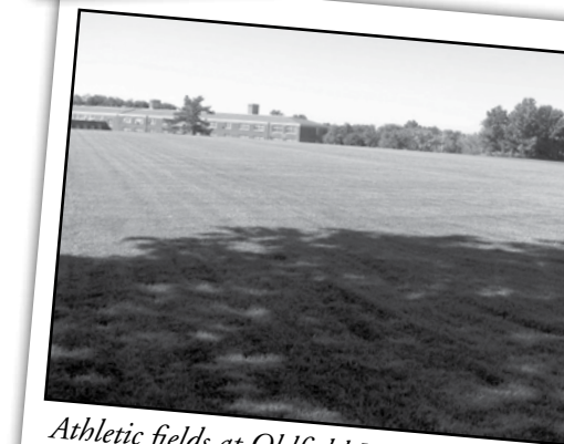
Athletic fields at Oldfield Middle School (pictured) and Harborfields High School were also renovated over the summer.