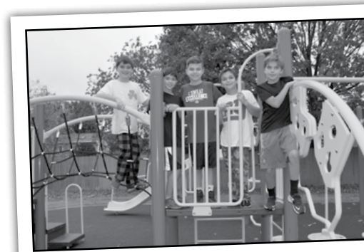
The new playground at Thomas J. Lahey Elementary School.

Class of 2029 at a Glance 189 : 20-22 : 100% # of Kindergartners : # of Students Per Class : Percentage of students bound for endless possibilities!