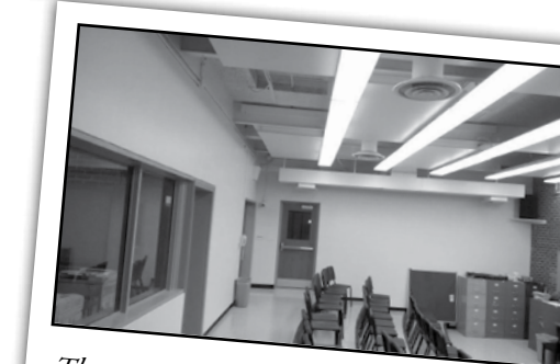
The renovated choral room at Harborfields High School.