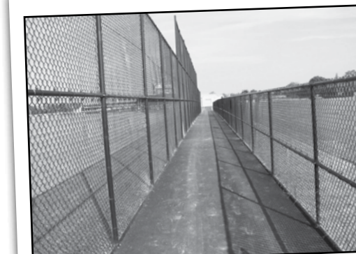
A path was added at Harborfields High School to the athletic fields, now making them more accessible to those with disabilities.