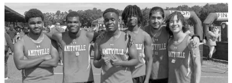
The Warriors varsity track and field program competed in the Wild Safari Invitational at Six Flags in September.