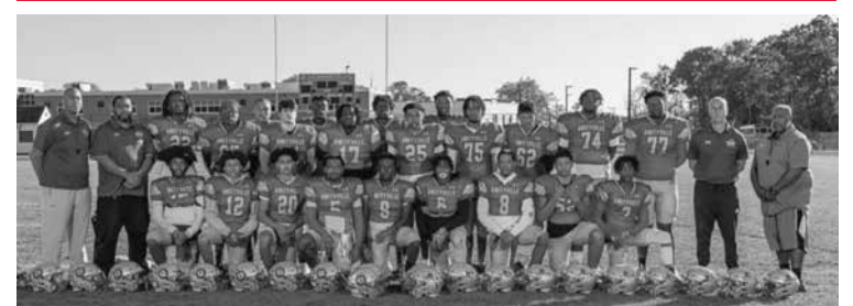
The Warriors varsity football team came very close to making the playoffs this fall.