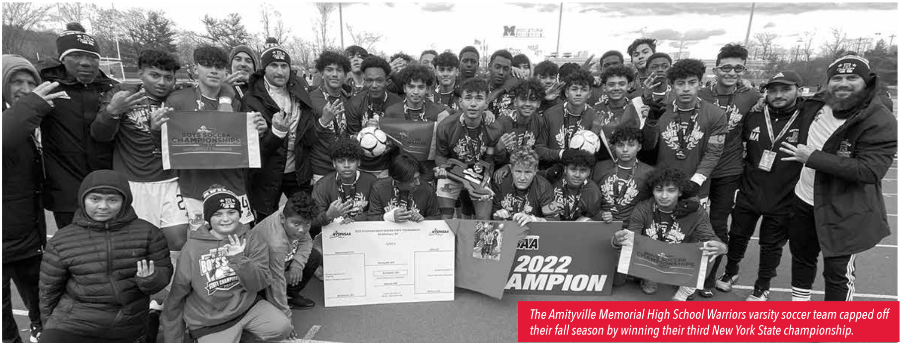
The Amityville Memorial High School Warriors varsity soccer team capped off their fall season by winning their third New York State championship.