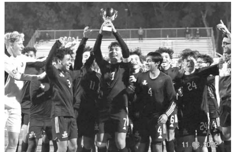
The Warriors varsity soccer team finished their remarkable season with a record of 20-1-1.

With the fall season in the books, the Amityville Union Free School District is proud of its student-athletes for their class both on and off the field.