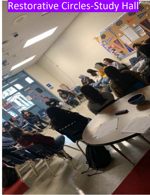
Restorative Circles-Study Hall