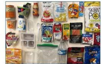
Photo of typical trash at Franklin. Almost NONE is recyclable.