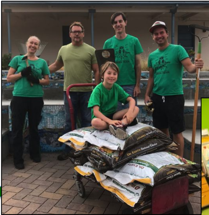
Urban Greening Grant & Campus Upkeep