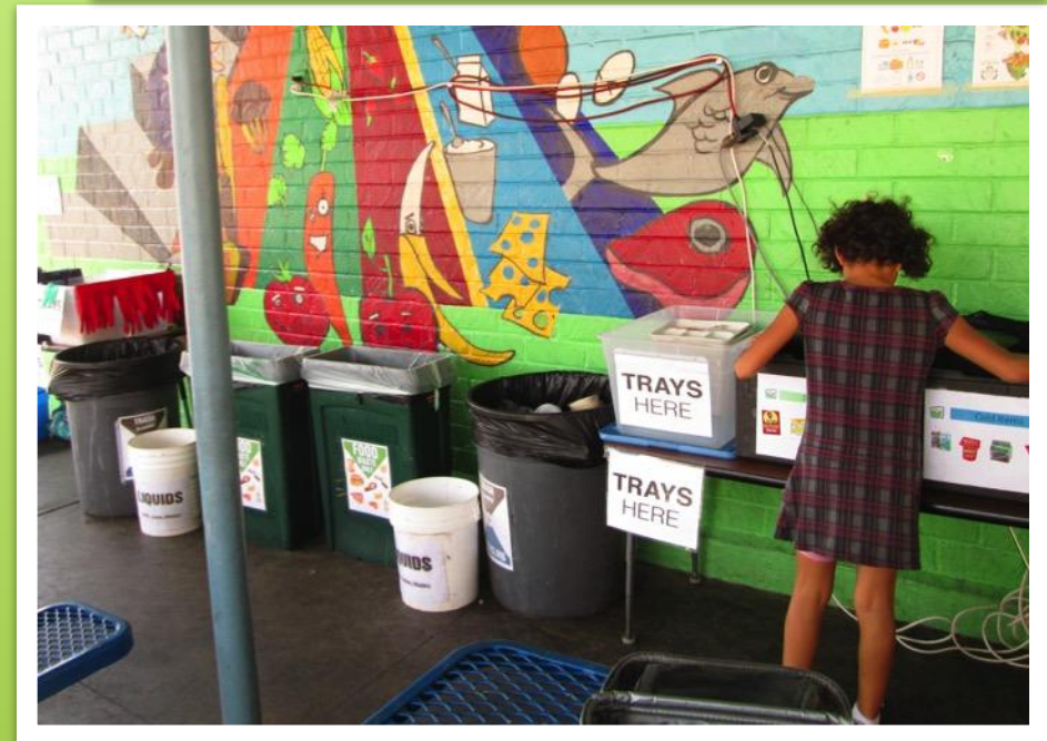
Student using the Share Table