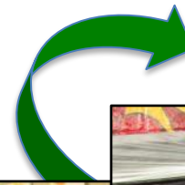
Organic Waste Separation