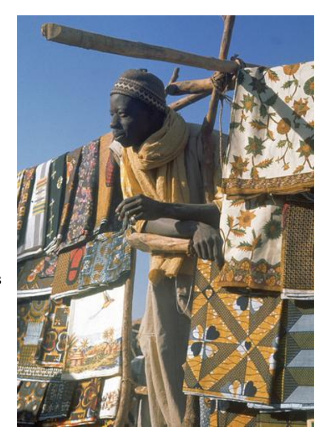
Islam reinforced the West African tradition of using geometric designs in arts and crafts, such as weaving.

Muslims also influenced the way people dressed in West Africa. Arab Muslims commonly wore an Arabic robe as an outer layer. An Arabic robe has wide, long sleeves and a long skirt. Muslims used calligraphy to personalize and decorate their robes. West Africans adopted the Arabic robe. Like Arabs, they still wear it today.