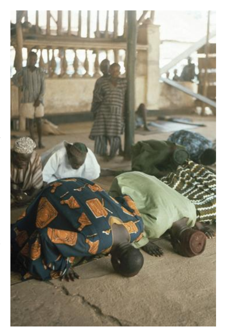
With the introduction of Islam, West Africans began praying five times daily, as many still do today.

Ibn Battuta was an Arab who traveled to Mali in the 14th century. Battuta was upset by some local customs there. For instance, women, including the daughters of rulers, went unclothed in public. Battuta also saw Muslims throwing dust over their heads when the king approached. These customs upset him because they went against the teachings of Islam.