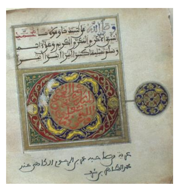
Arabic, the language of the Qur'an, became the language of learning, government, and trade in West Africa.

Scholars used Arabic to write about the history and culture of West Africa. They wrote about a wide variety of topics. They described how people used animal and plant parts and