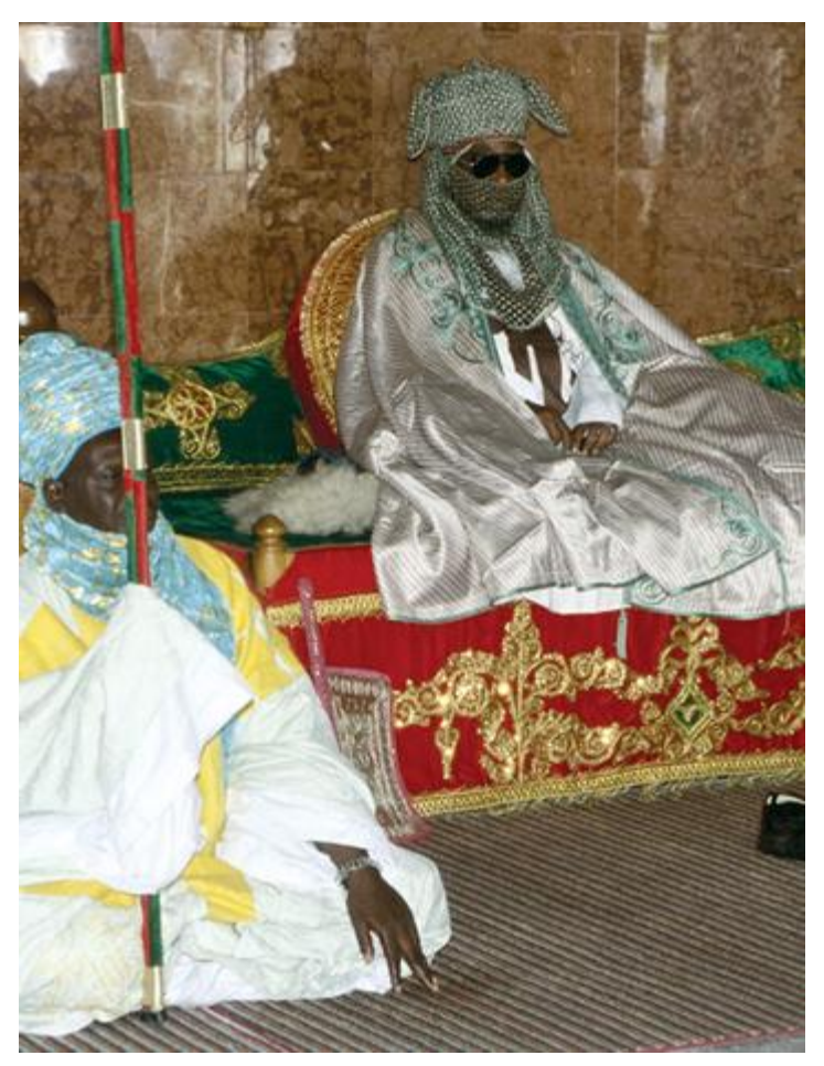
With the arrival of Islam, the power of the central ruler increased and local chiefs grew less important.

A third major change was the adoption of shari'ah (Islamic law). In many towns and cities, shari'ah replaced customary law. The customary law of West Africa was very different from shari'ah. Laws were not written, but everyone knew what they were and accepted them from long tradition. A chief or king usually enforced customary