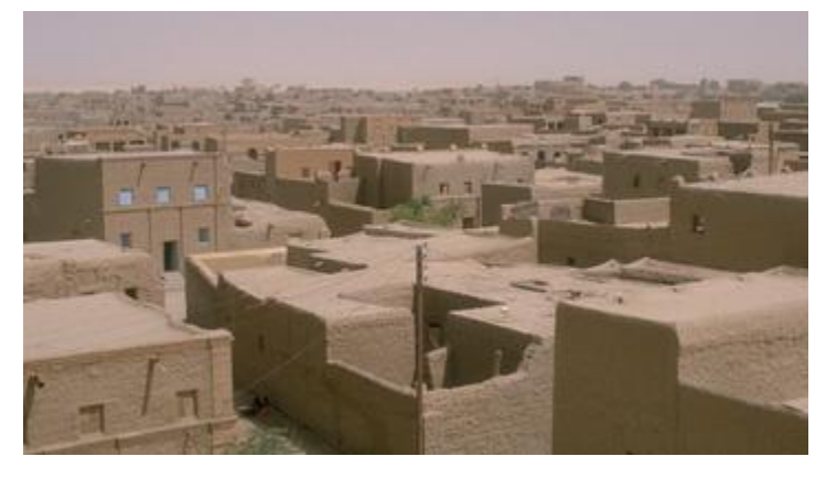
Islamic architects built flat-roofed houses made of sun-dried bricks.

Al-Saheli introduced another feature to houses; clay drain pipes. The pipes improved the quality of people's lives, because during the rainy season they prevented damage to homes from rainwater.