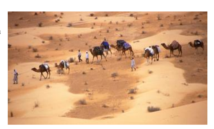
Muslim traders and the missionaries who accompanied them spread Islam to Ghana and beyond.

Traders Bring Islam to Ghana Between the years 639 and 708 C.E., Arab Muslims conquered North Africa. Before long, they wanted to bring West Africa into the Islamic world. But sending armies to conquer Ghana was not practical. Ghana was too far away, and it was protected by the Sahara.