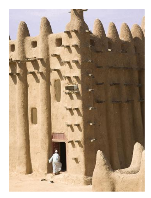
The Grand Mosque in Mali was built of bricks and mud.

Islamic beliefs and customs affected many areas of life besides religious faith. In this chapter, you will learn about the spread of Islam in West Africa. Then you will look at Islam's influence on several aspects of West African culture. You will explore changes in religious practices, government and law,