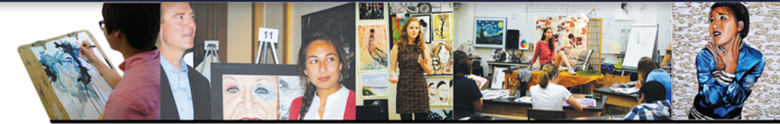
Award-winning Visual Arts Program

CV's Visual Arts Department has earned a strong reputation for superior artistic accomplishment, winning top honors in the Scholastic Art Competition, the Congressional Arts Competition, the Music Center Art Competition, and county-wide ceramics competitions among others. Students thrive in this popular, highly creative, demanding discipline, often developing a passion for the arts that motivates them to enter careers in Photography, Fine Arts, Graphic Design, Entertainment Design, Illustration, Ceramics and Art History.