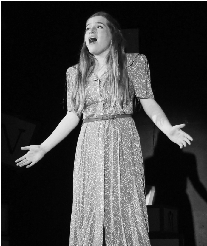
The GCS Drama Club returned to the stage and performed Matilda for its Spring Production.