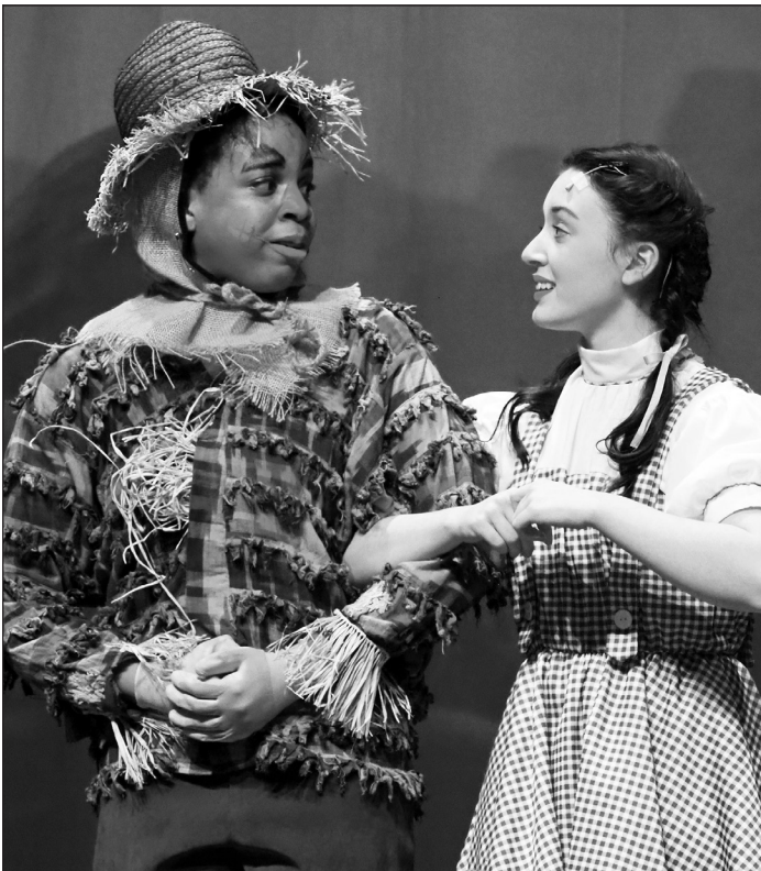
Students in the Jr./Sr. High School performed in The Wizard of Oz during the Spring Musical. This was the first time the new auditorium was used for a musical performance.