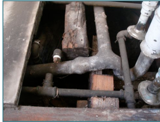
Example of lead pipes in a plumbing system.