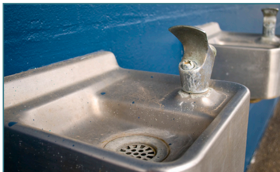
Lime build-up on mouthpiece and protective guard of drinking fountain.

the water from coming through the mouthpiece and going down the drain.