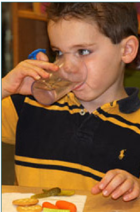
Lead exposure poses a great risk to young children.

EPA developed the 3Ts for Reducing Lead in Drinking Water in Schools, Revised Technical Guidance (Training, Testing and Telling) to help schools and child care facilities implement simple strategies for managing the health risks of lead in drinking water. The 3Ts include: