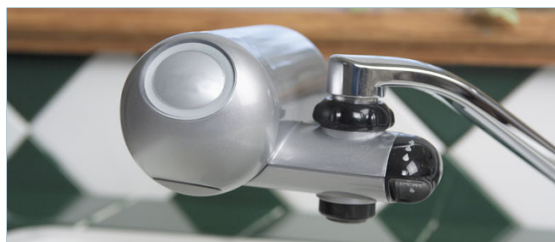
A faucett filtration system.