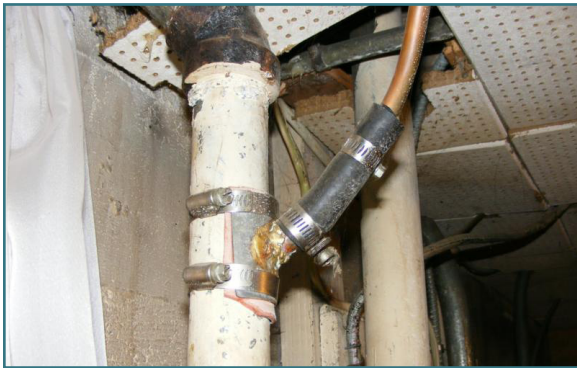
A cross connection between a dishwasher drain (copper pipe) and a main pipe.

Hot water tanks are susceptible to the development of biofilm, which is a surface deposit of bacteria that accumulates creating a slime layer. Similar to the plaque that forms on teeth biofilms accumulate over time. It is recommended that you consult with an experienced professional to have your hot water tank periodically cleaned to remove existing biofilms and sediments. 2