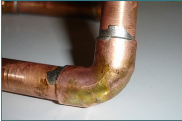
Copper pipes joined by lead solder.