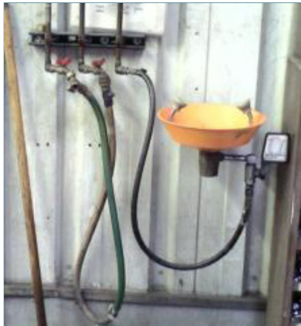
A garden hose creates a dangerous cross connection between potable and non-potable water.