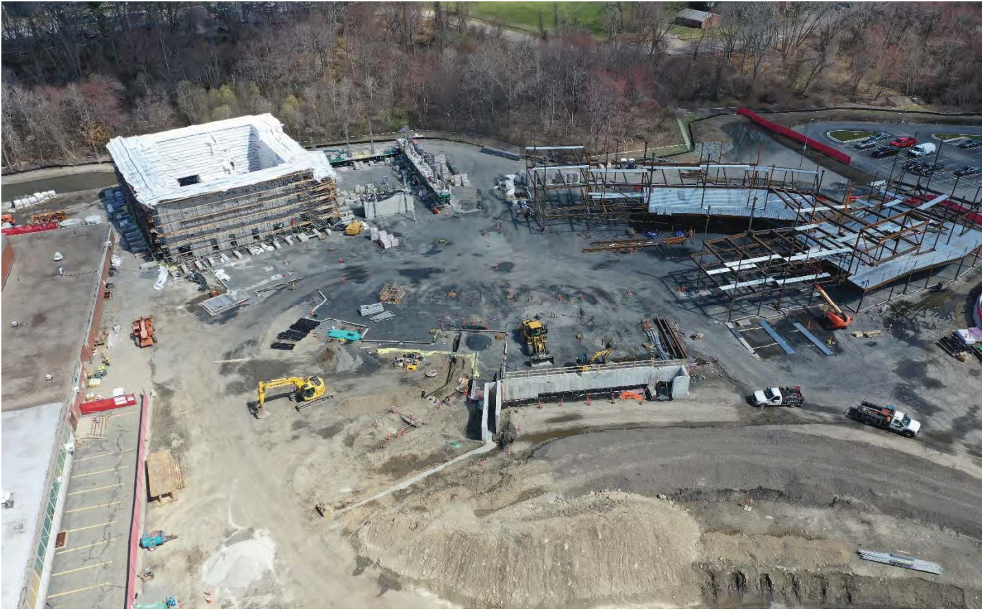
Photos 1 & 2: Aerial Drone Views of the site showing the masonry scaffolding enclosure for the gymnasium.