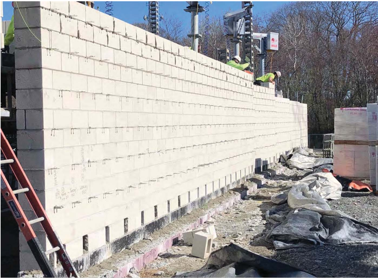
Photo 3: Masons erecting the East Wall of the auditorium using the scored CMU per PR-0022