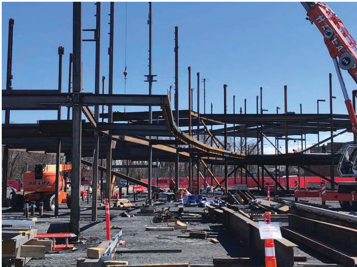
Photo 4: Steel has been erected for approximately ¼ of the project which began on March 16, 2020.