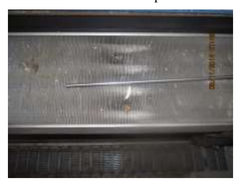
Pre-Cleaning Room A16: Coil