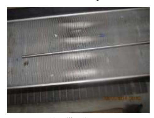
Pre-Cleaning Room A8: Coil