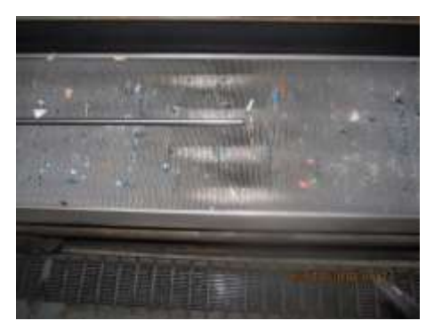
Pre-Cleaning Room A18: Coil