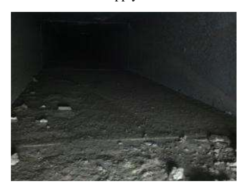
Pre-Cleaning H & V Supply Ductwork