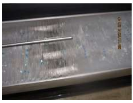
Post-Cleaning Room A18: Coil