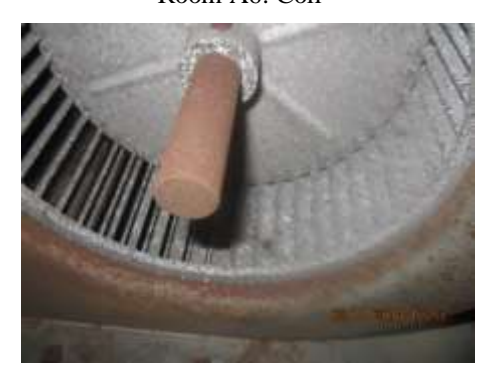
Pre-Cleaning Room A6: Fan