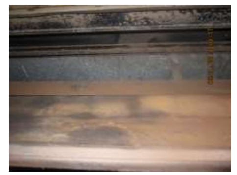
Post-Cleaning Room A16: Filter Compartment