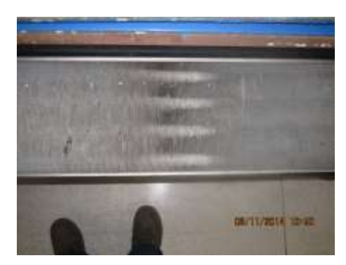
Post-Cleaning Room A12: Coil