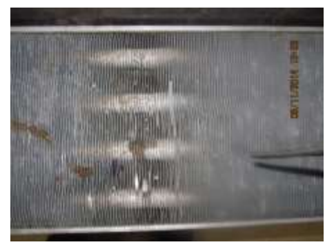
Post-Cleaning Room A6: Coil