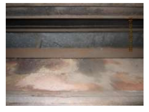
Pre-Cleaning Room A6: Filter Compartment