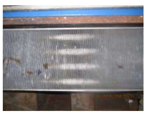
Pre-Cleaning Room A6: Coil