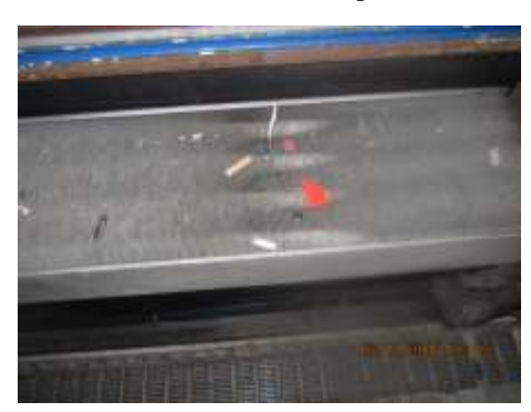
Pre-Cleaning Room A12: Coil