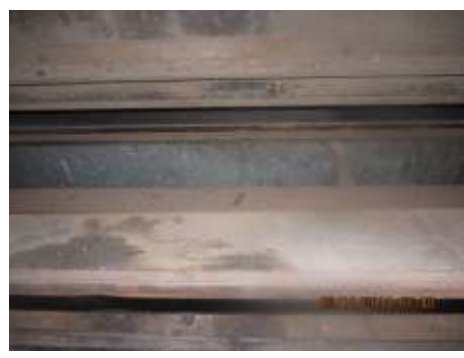
Pre-Cleaning Room A16: Filter Compartment