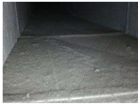
Pre-Cleaning H & V Supply Ductwork