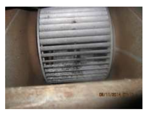
Pre-Cleaning Room A18: Fan