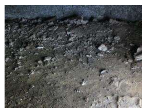
Pre-Cleaning H & V Supply Ductwork