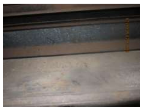
Pre-Cleaning Room A8: Filter Compartment