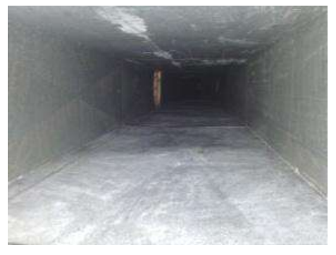
Post-Cleaning H & V Supply Ductwork