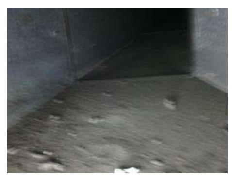
Pre-Cleaning H & V Supply Ductwork