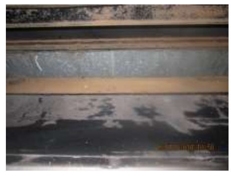
Post-Cleaning Room A12: Filter Compartment