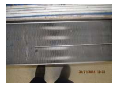
Post-Cleaning Room A8: Coil