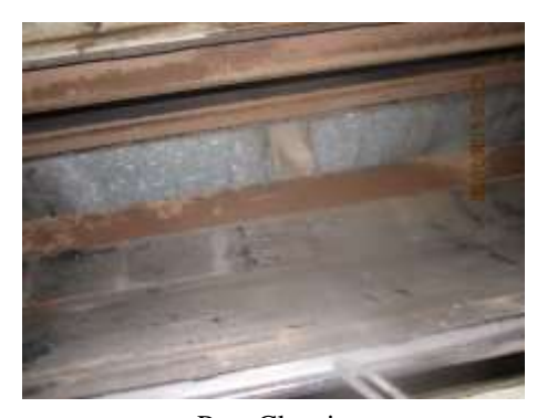
Post-Cleaning Room A18: Filter Compartment