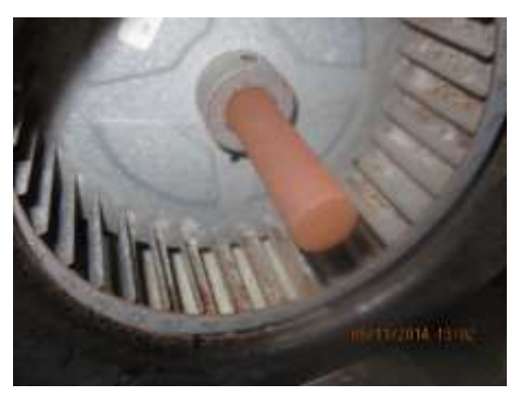
Post-Cleaning Room A8: Fan