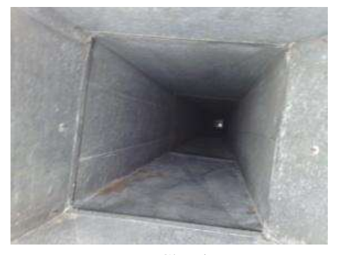
Post-Cleaning H & V Supply Ductwork