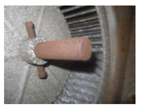
Pre-Cleaning Room A16: Fan