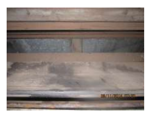
Pre-Cleaning Room A18: Filter Compartment