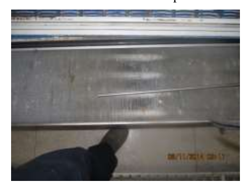
Post-Cleaning Room A16: Coil