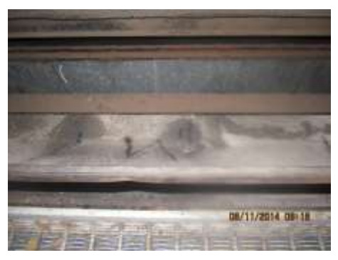
Pre-Cleaning Room A12: Filter Compartment