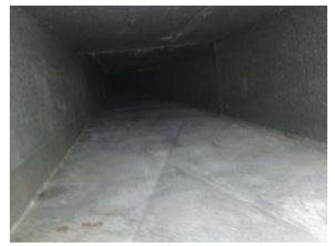
Post-Cleaning H & V Supply Ductwork