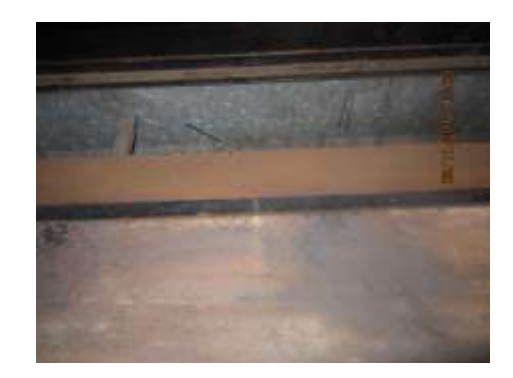
Post-Cleaning Room A6: Filter Compartment