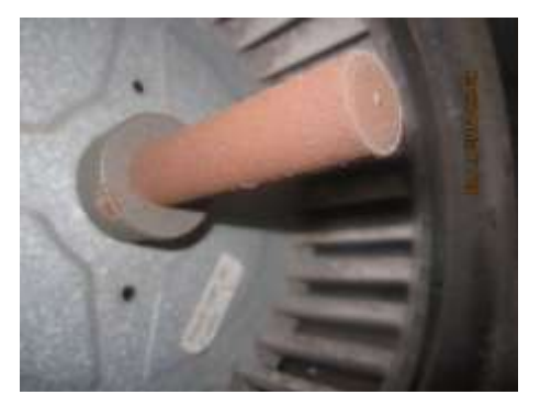
Pre-Cleaning Room A8: Fan