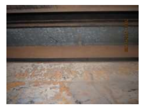
Post-Cleaning Room A8: Filter Compartment