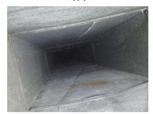
Post-Cleaning H & V Supply Ductwork