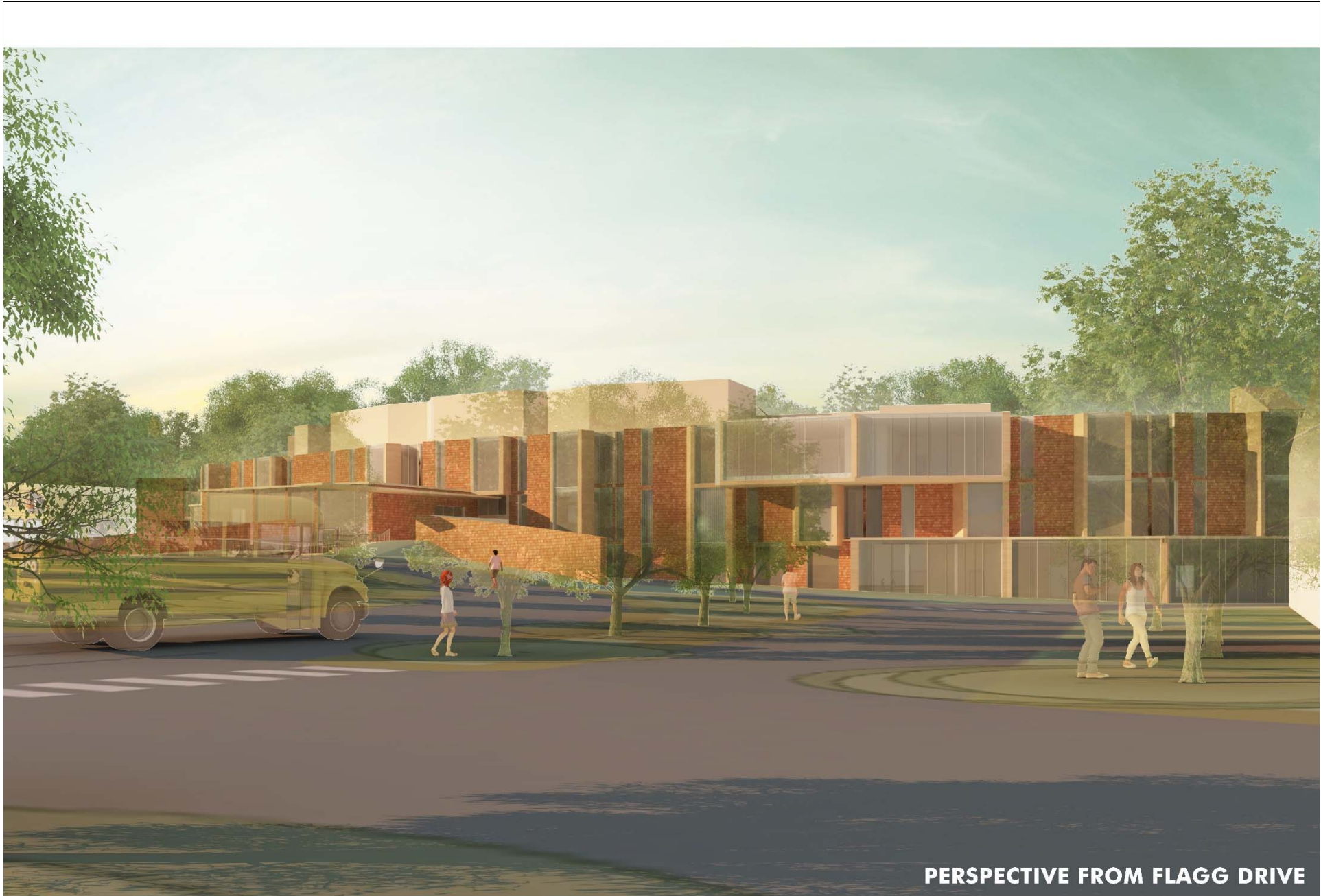
PERSPECTIVE FROM FLAGG DRIVE