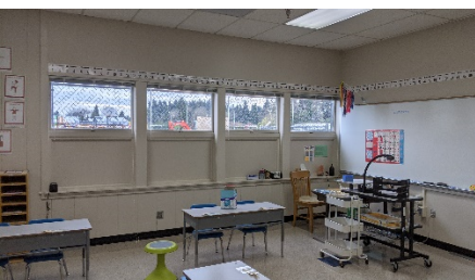
East Wall continued