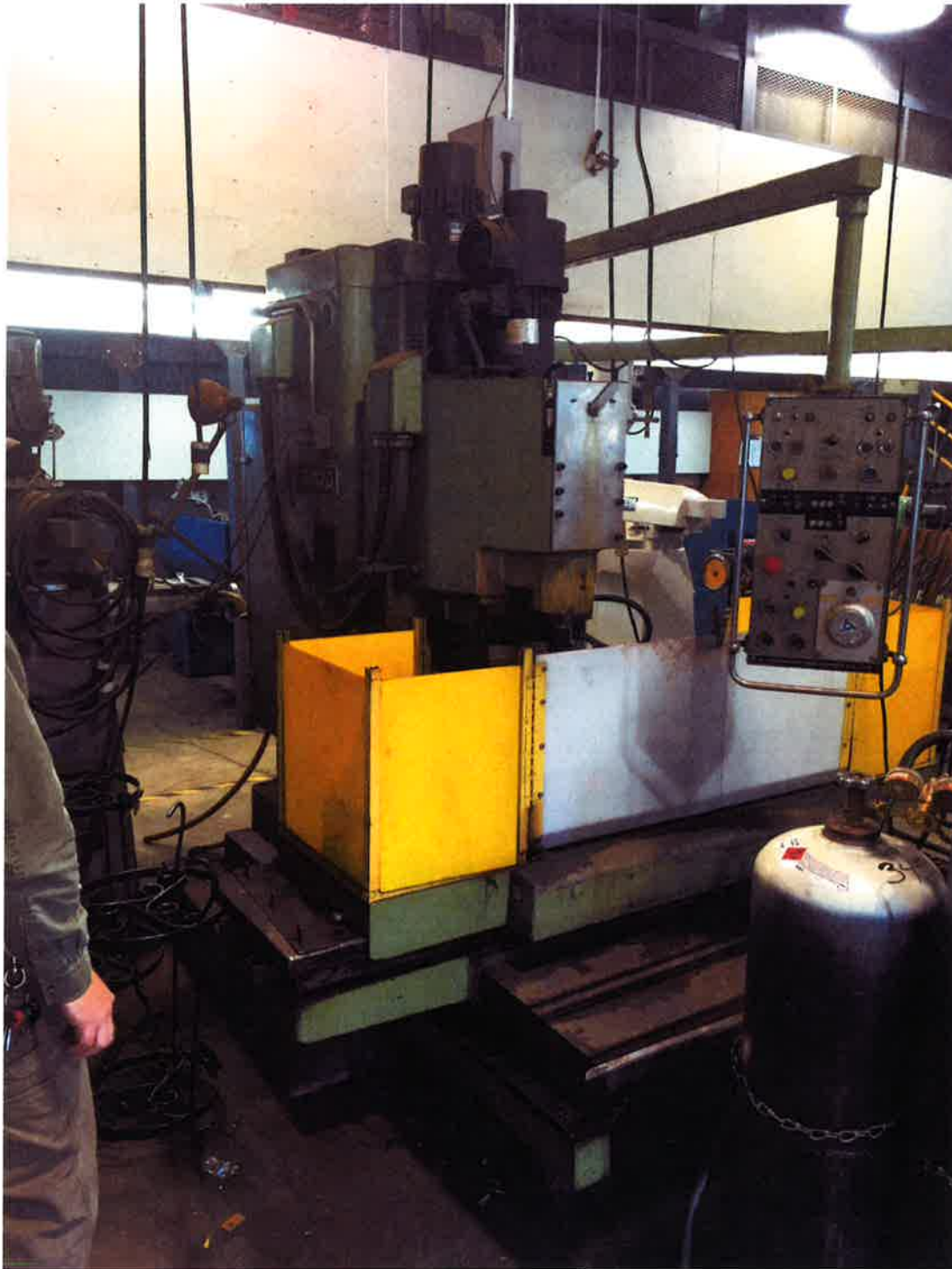
Kitamura T-12 CNC mill 220v 3phase Serial #8232 Table 20"x40", travel 36" (x axis) 20" (y axis) Feed 300" per minute Manufactured 1979