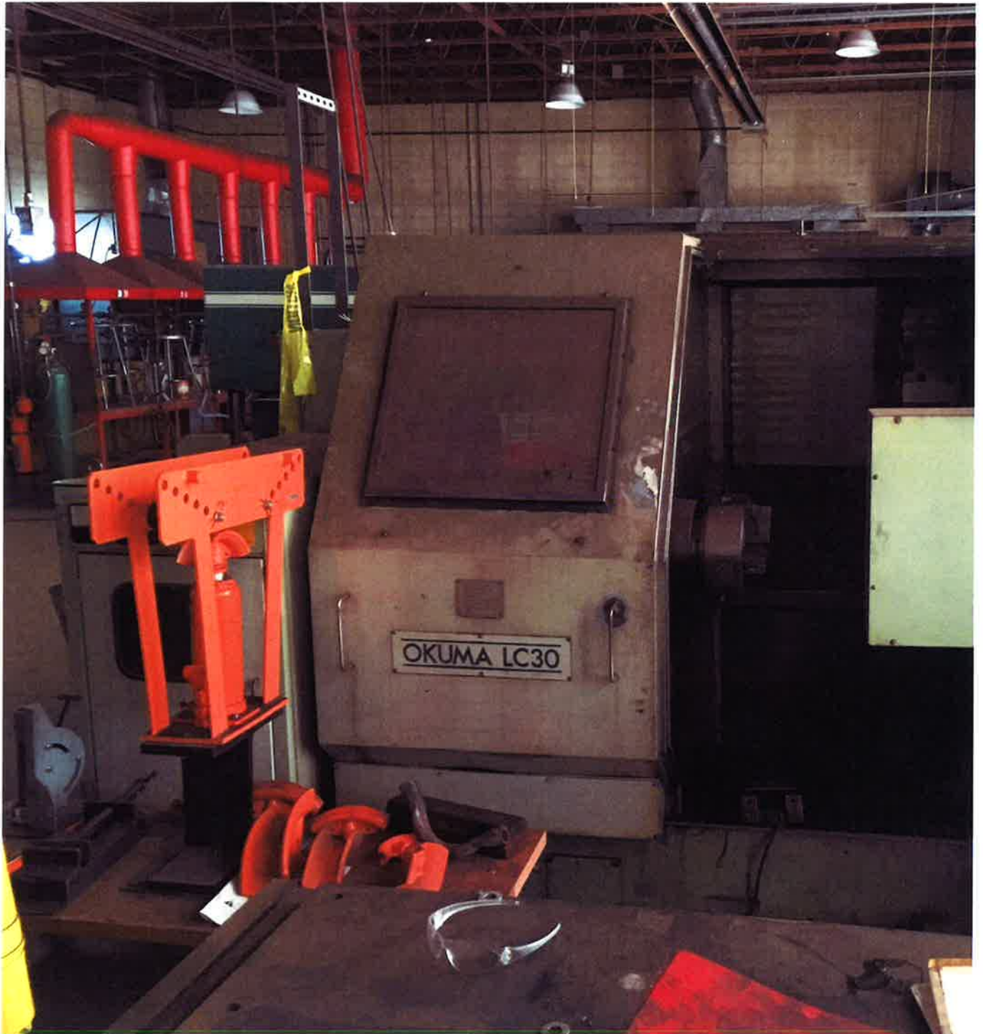
Okuma lc30 CNC lathe 220v 3phase 70 amp serial #54120108 Single turret multi-tool head w/chip conveyor Purchased used in 1986