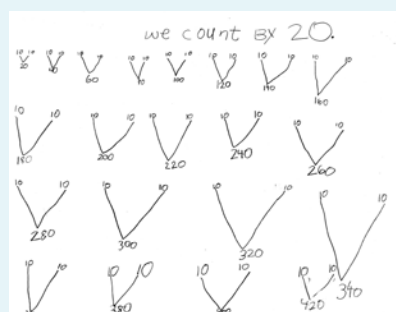
b. Their recording of moving the chains two at a time from the table to the floor

record the numbers they can count to. We watch to see if anyone is counting by twos or grouping objects into tens.