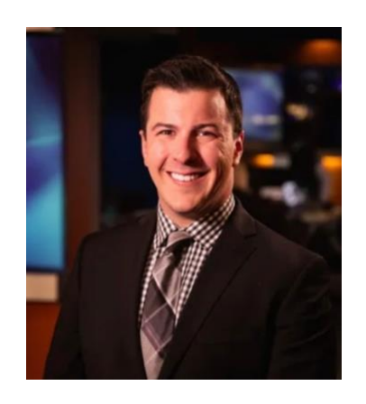
IAN STEELE, ABC6