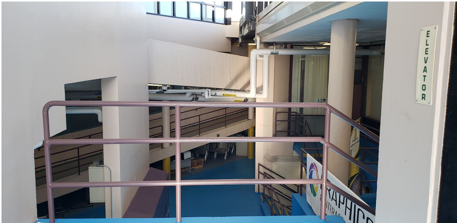
On level 3.5 of the 1971 wing