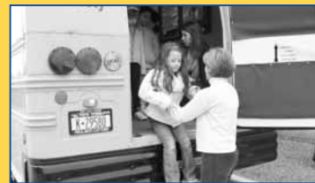
First graders at Deauville Gardens Elementary School learn the proper safety procedures for evacuating a school bus during Safety Sally's visit.

Equipped with television monitors, a wheelchair lift and a video camera that are all used during the training, the bus was parked outside the school while students took turns visiting. The children were also taught about the roles of the bus driver and the students, seat belt safety and procedures for evacuating the bus.