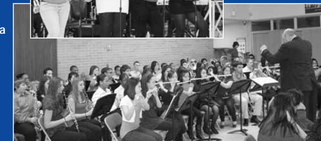
Members of the Walter G. O'Connell Copiague High School Band opened up the annual POPS concert by playing the theme from Disney's The Incredibles .