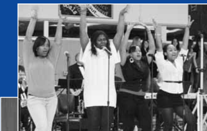
Four students from the Walter G. O'Connell Copiague High School concert perform A Taste of Honey's hit song "Boogie Oogie Oogie" during the annual POPS concert.

Throughout the night, members of the band and chorus performed solo and group performances ranging from Jason Mraz's "I'm Yours" and Fergie's "Big Girls Don't Cry" to the theme from Disney's The Incredibles and John Lennon's "Let it Be."